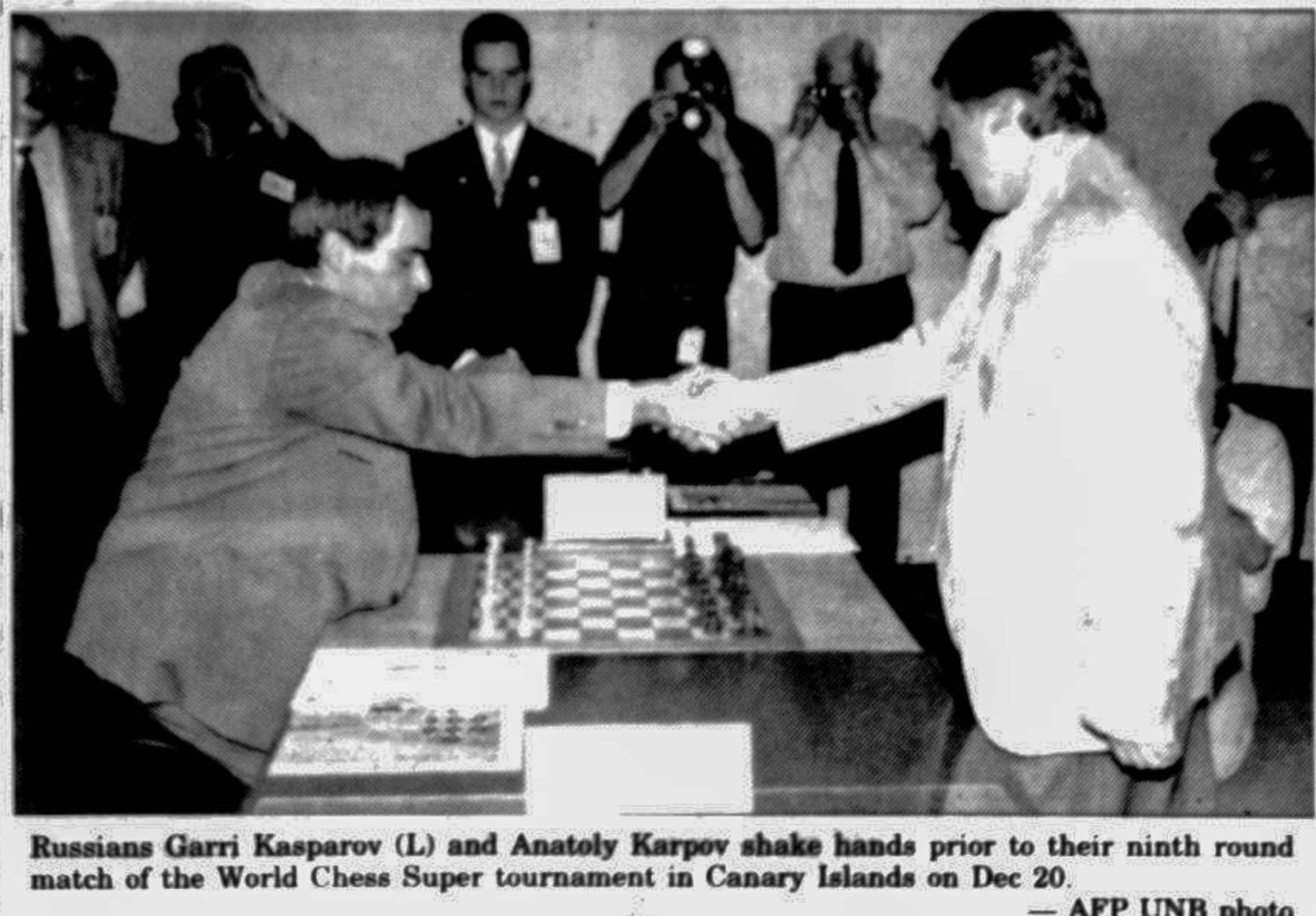
Russians Garri Kasparov (L) and Anatoly Karpov shake hands prior to their ninth round match of the World Chess Super tournament in Canary Islands on Dec 20.