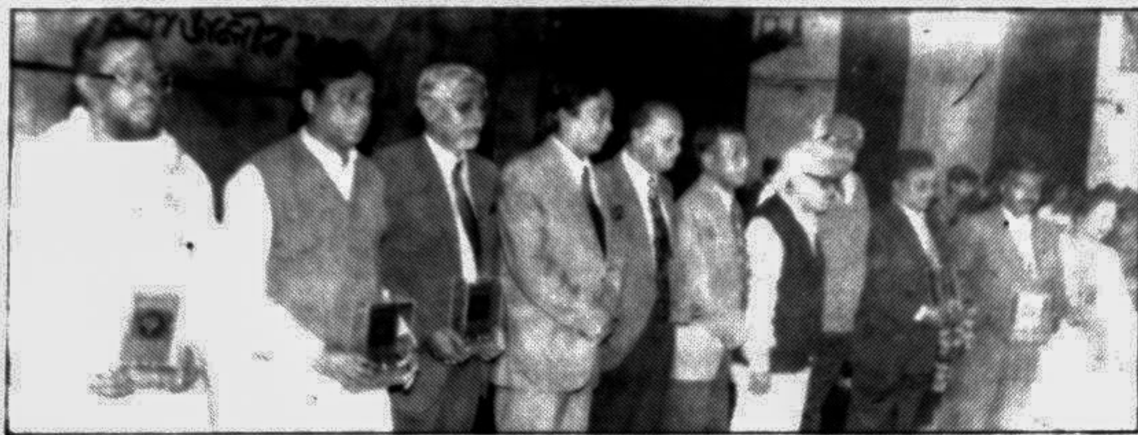
'Banglaer Mancha' accorded reception to valiant Freedom Fighters including the Sector Commanders at the Bangladesh Shishu Academy auditorium in the city yesterday.