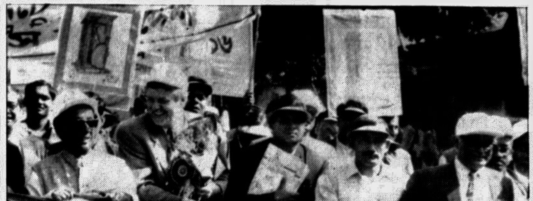
A colourful rally, organised by the Public Health Engineering Department, marking the National Sanitation Week '96, held in the city yesterday.

It observed that government was following World Bank prescribed programmes instead of pursuing progressive economic reforms.