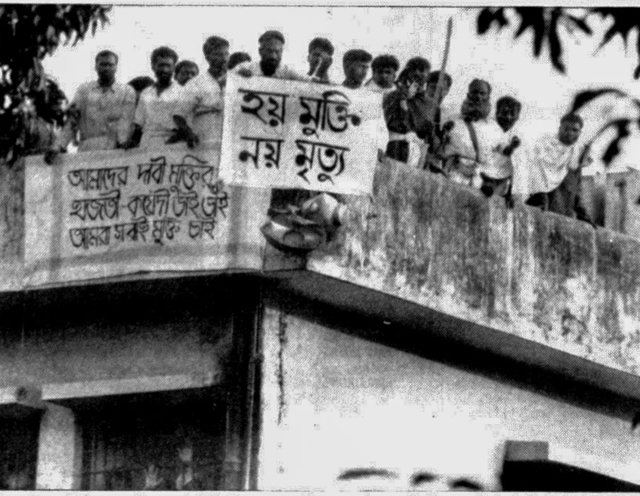
Inmates of Jessore Central Jail demonstrating on the roof of one of the jail buildings yesterday.

Deve Gowda due Jan 5 Indian Prime Minister H D Deve Gowda will visit Bangladesh January 5-6 at the invitation of his counterpart, official sources said yesterday, reports UNB. Gowda was invited to visit Bangladesh by Prime Minister Sheikh Hasina during her tour of New Delhi in the second week of this month, when the Ganges water treaty was signed between the two countries. See Page 12 Col 6