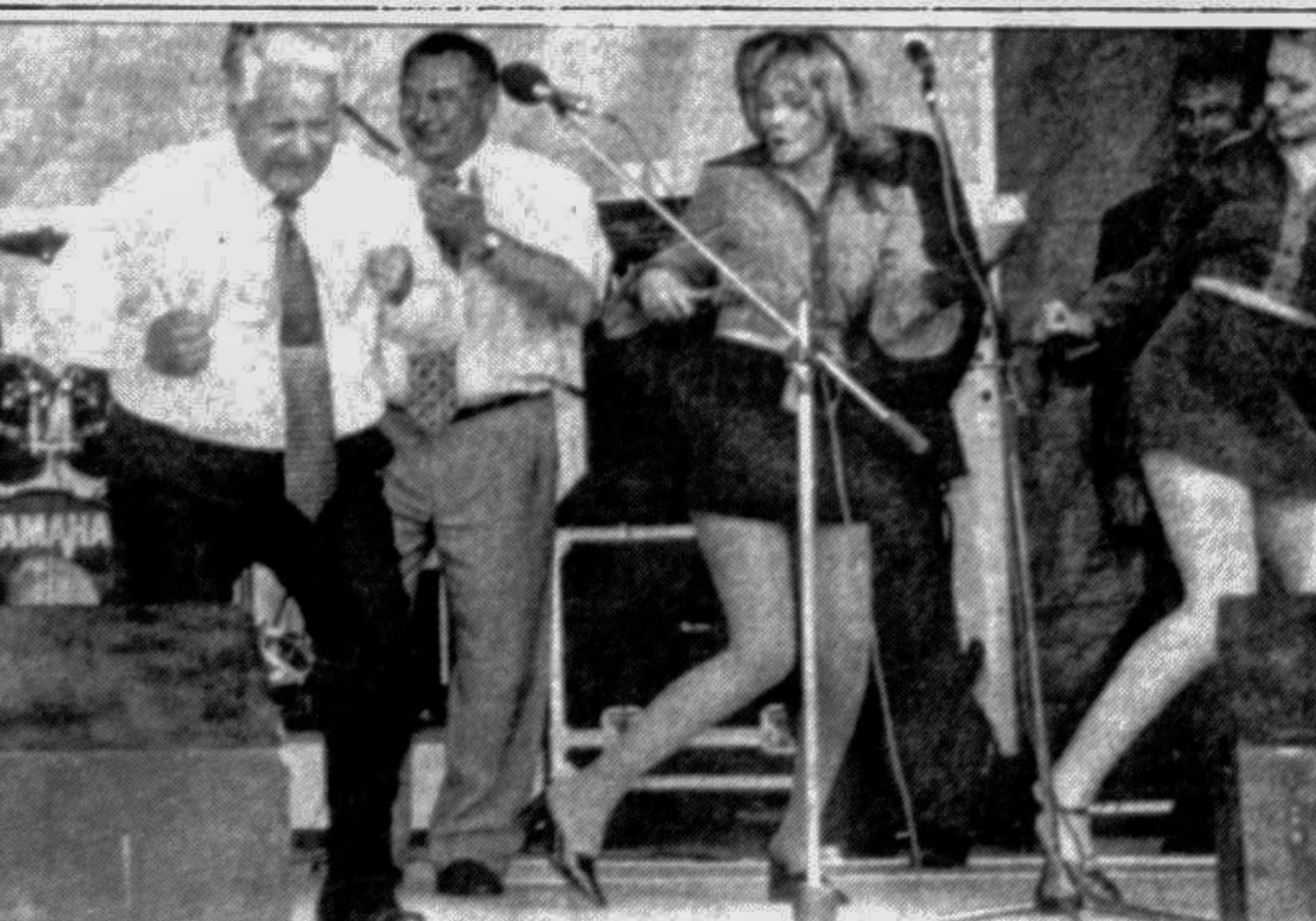
Russian President Boris Yeltsin rocks with pop musicians at a campaign rally concert. Yeltsin's energetic stumping, defying rumours of deteriorating health, won him re-election a week later, but also sealed his candidacy for multiple heart bypass surgery by autumn.

WASHINGTON, Dec 20: All East Asian countries — even China — welcome the US-Japanese alliance as a deterrent against Japanese military resurgence.