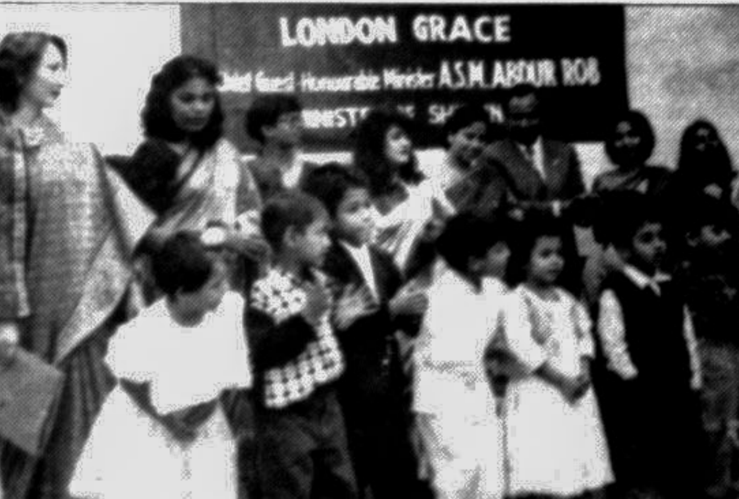
Shipping Minister ASM Abdur Rab attended as chief guest in the annual prize giving ceremony of London Grace School in the city recently.

LGRD and Cooperatives Minister Zillur Rahman has said government is considering to set up Palli Parishad (village council) as an organ of local government body with a view to eradicating poverty and illiteracy, reports UNB. "The objectives of independence are to remove poverty, hunger and illiteracy from the country," he said, while inaugurating a poverty eradication and employment generation project in Bhairab yesterday. The minister said the Government is implementing projects in the dry season to build up infrastructure at village level by involving the rural poor. A total of 114 projects have been undertaken in Bhairab for the next dry season for poverty alleviation and employment generation. It is not possible to remove poverty without expanding education rapidly, Zillur said, mentioning that the government has made highest budgetary allocation for the education sector. The private sector will have to come forward in eradicating illiteracy and alleviating poverty alongside government efforts, he said.