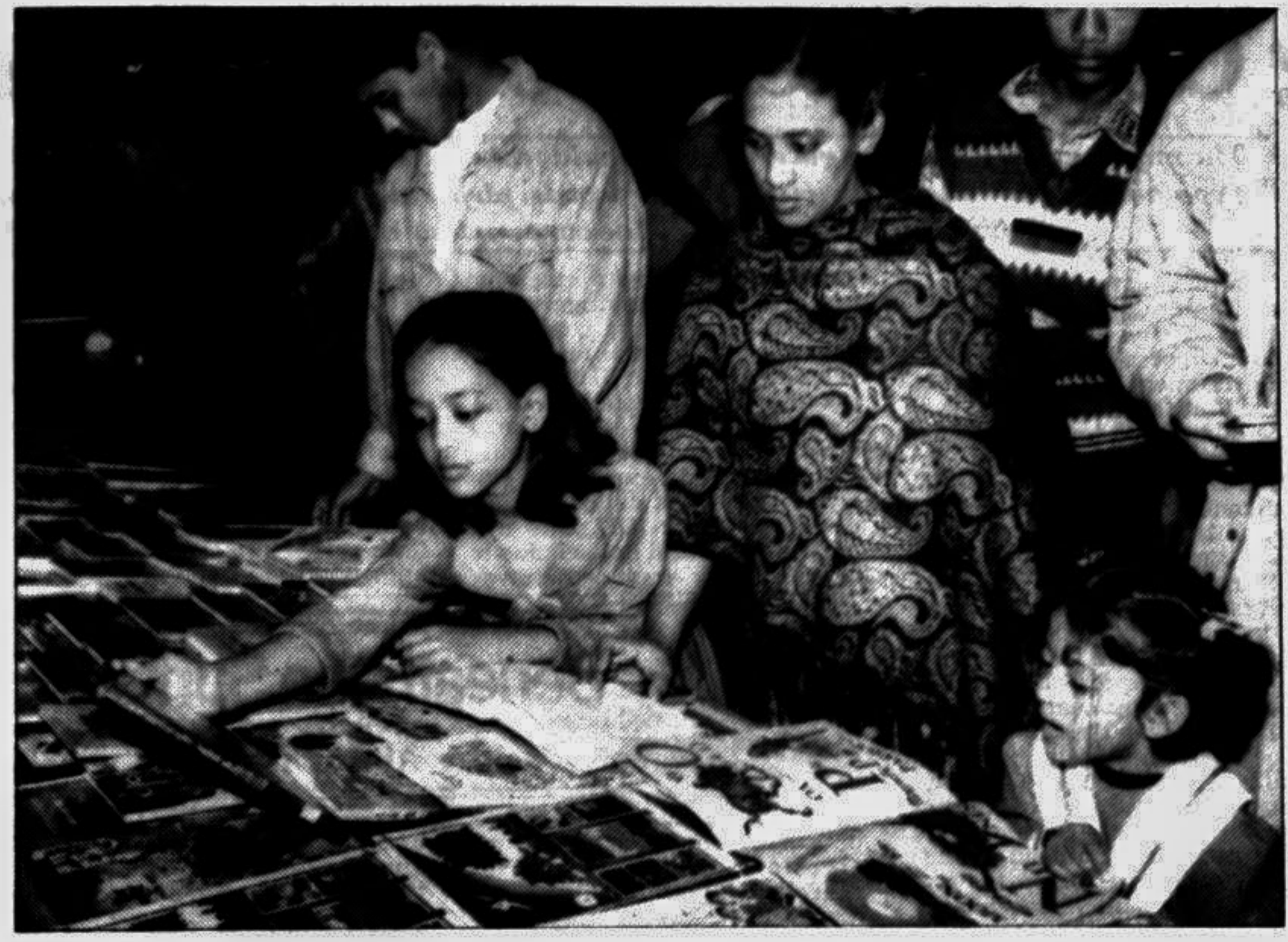
Visitors at the Third Dhaka Book Fair in the city yesterday.