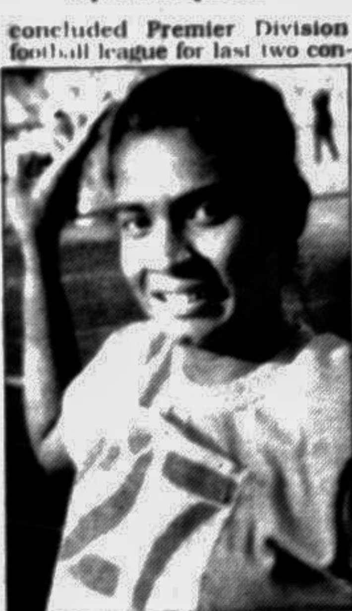
LOVELY... 200m gold

In a one sided affair, Nakib, the leading scorer in the just