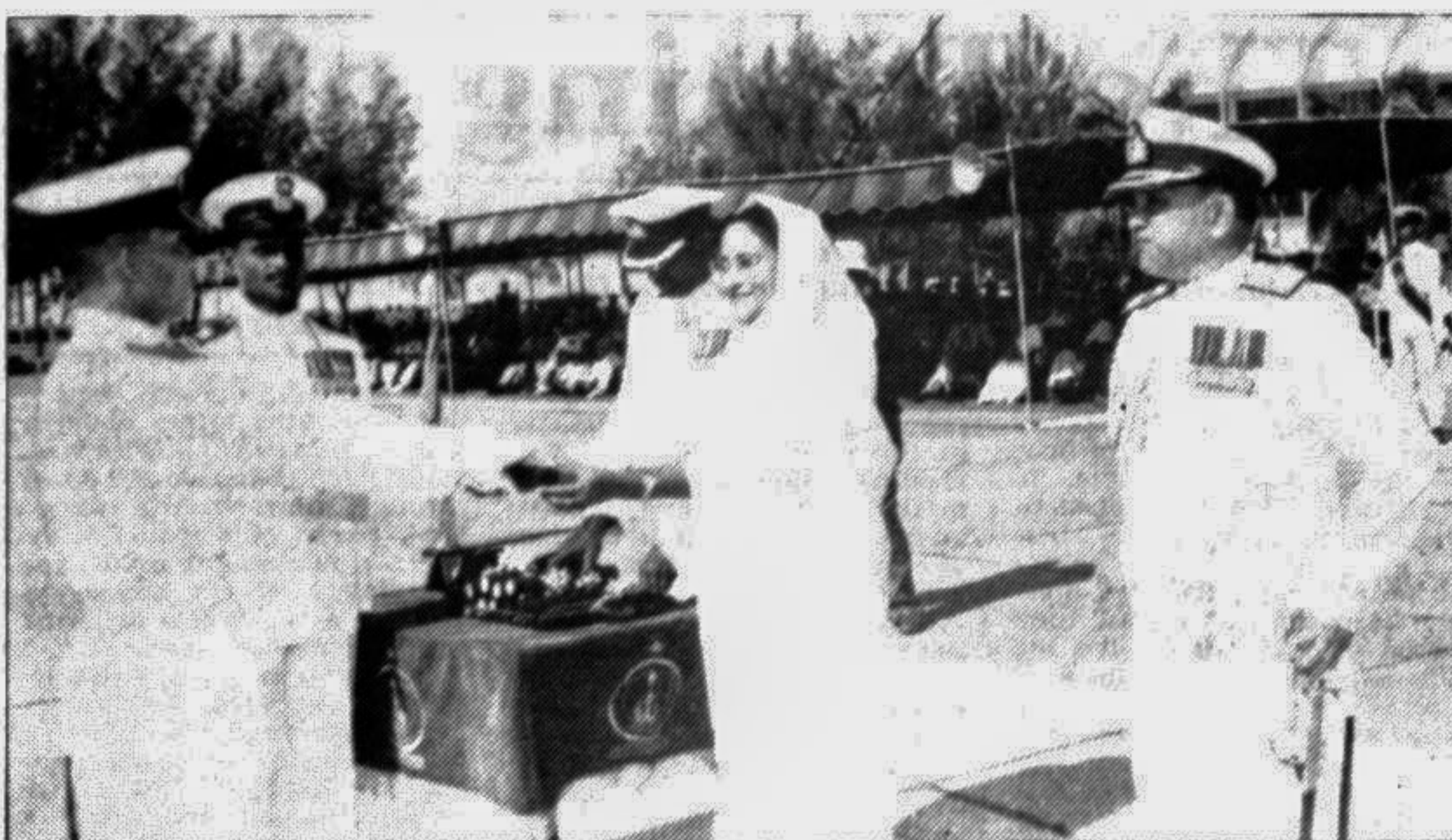
Prime Minister Sheikh Hasina giving away trophy to a midshipman Mostafizur Rahman for his outstanding performances in academic and professional subjects at the Bangladesh Naval Academy in Chittagong yesterday.

Mayor of Dhaka Mohammad Hanif yesterday urged all concerned to present the true history of the War of Liberation and Independence to the future generation of the country, reports BSS. Speaking as the chief guest at a discussion organised by a cultural group Nagar Sanskritik Goshthe in observance of the Silver Jubilee of the Independence at Nagar Bhaban in the city mayor said Bangladesh emerged through an armed struggle in 1971 at the call of Bangabandhu Sheikh Mujibur Rahman.