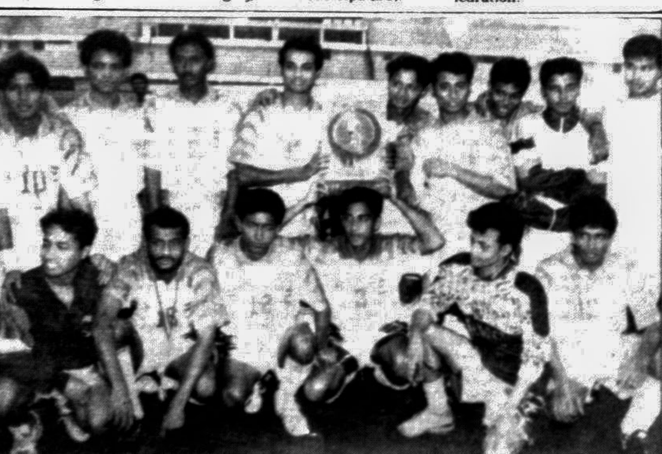
The victorious Usha Krira Chakra hockey team with the Bijoy Dibash Cup trophy.

Leading goalkeepers: 13 - Nakib (Muktijoddha); 12 - Tutul (Agrani Bank); 10 - Alfaz (MSC), Sourav Raju (East End); 8 - Mizan (Abahani); 6 - Rumi (Abahani); 5 - Arman (MSC), Reaz (Muktijoddha); 4 - Rakib, Kazakov (Abahani), Ranjan (MSC), Roxy (Arambagh), Towhid (Parashanj), Jamal and Tipu (BU).