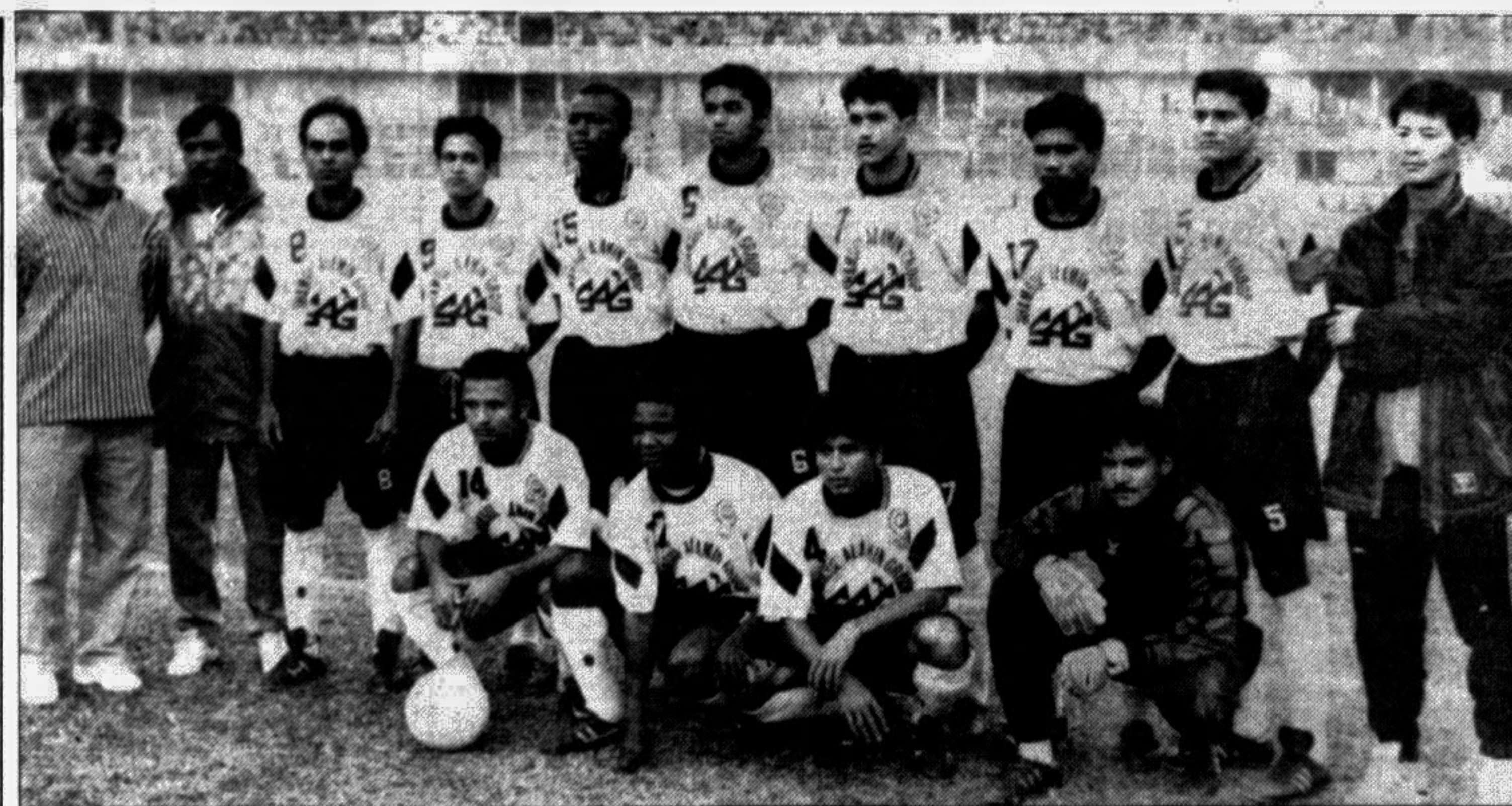
UNCONQUERED CHAMPS: Players and officials of Mohammedan Sporting Club who became unbeaten champions in the Danish Premier Division football league.