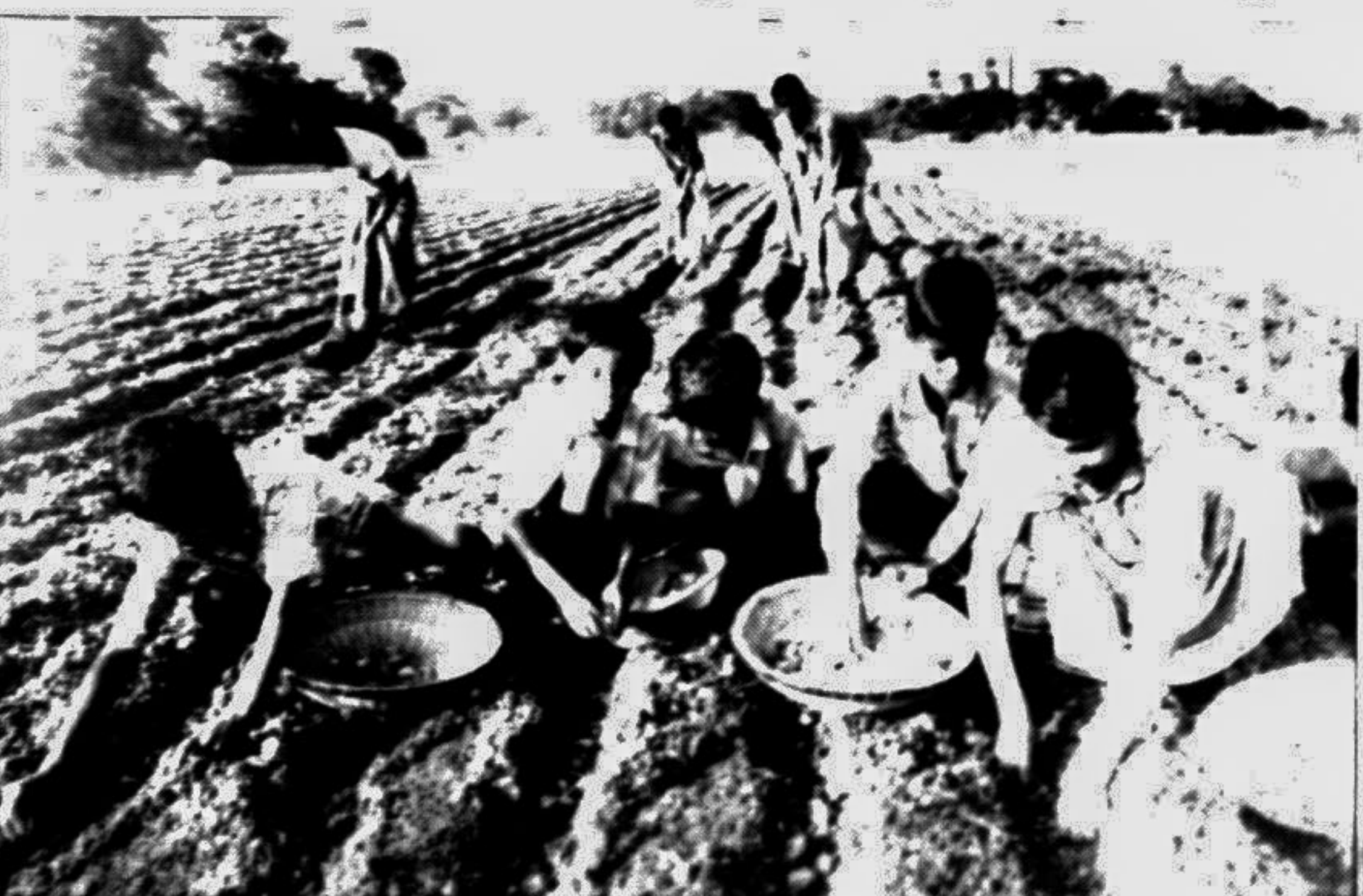
Potato seeds being planted in a field at Sonarong village under Tongibari thana of Munshiganj