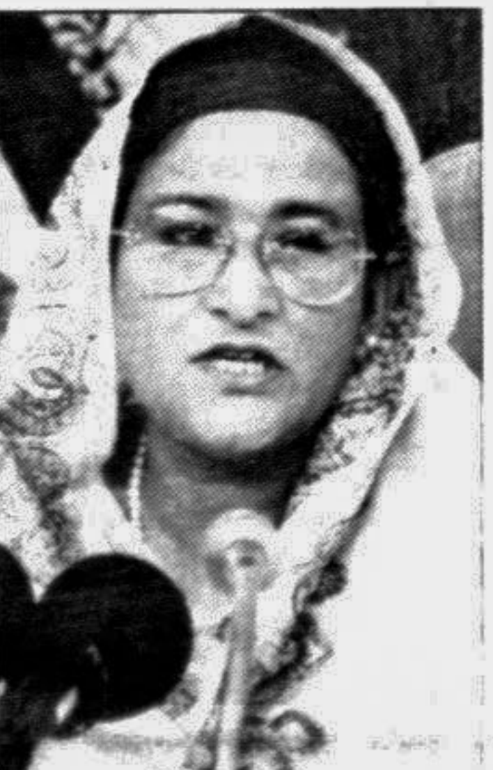
Sheikh Hasina addressing a press conference yesterday.

Prime Minister Sheikh Hasina said yesterday that the Ganges water sharing treaty with India had opened up the prospect of solving other regional problems and further expansion of mutual cooperation.