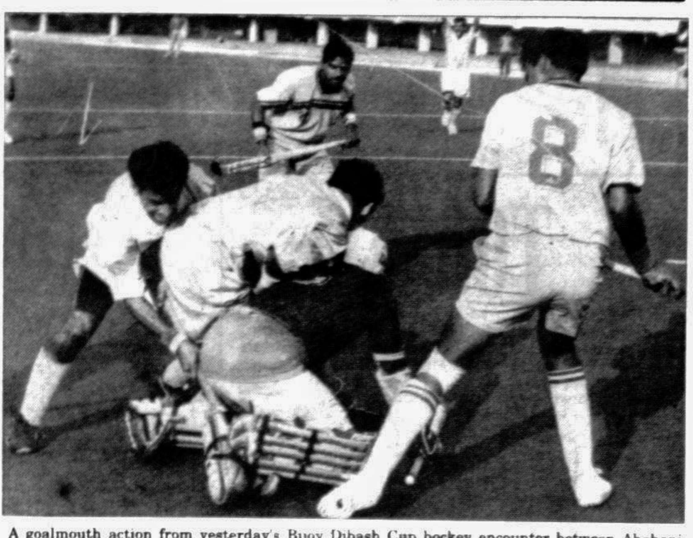
A goalmouth action from yesterday's Bijoy Dibash Cup hockey encounter between Abahani Krira Chakra and Bangladesh Air Force at the hockey stadium.

Favourites Abahani Krira Chakra and Usha Krira Chakra will meet each other in the second semifinal of the Bijoy Dibash Cup hockey tournament tomorrow after both giants were convincingly through in their respective quarterfinals yesterday held at the National Hockey Stadium.