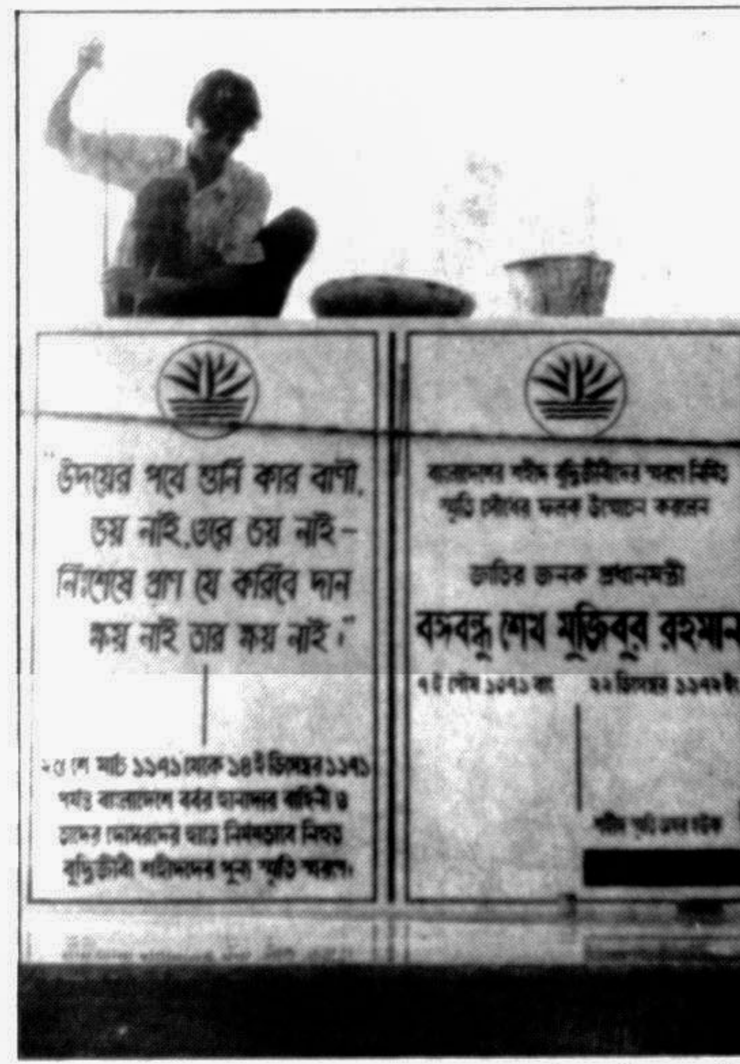
A new plaque being installed at the Martyred Intellectuals memorial at Mirpur in the city.

A reminiscence meeting was held in the conference room of