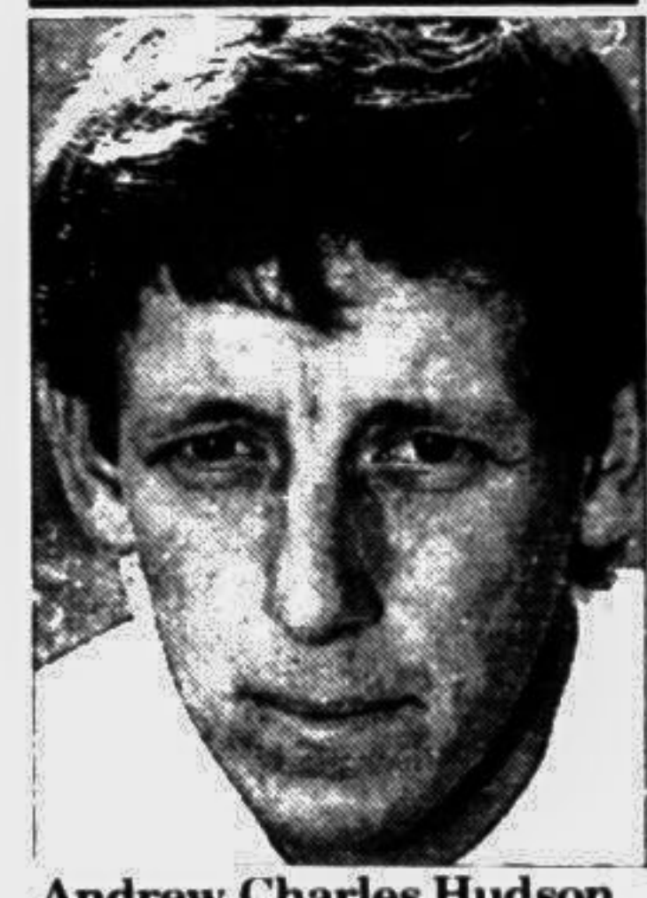
Andrew Charles Hudson (South African Test cricketer)

"I'd like to be remembered as a guy who quietly got on with the job and scored runs. I'd also like to be remembered as a team-man, a guy who was concerned about other people's performances and how the other guys in the team were doing."