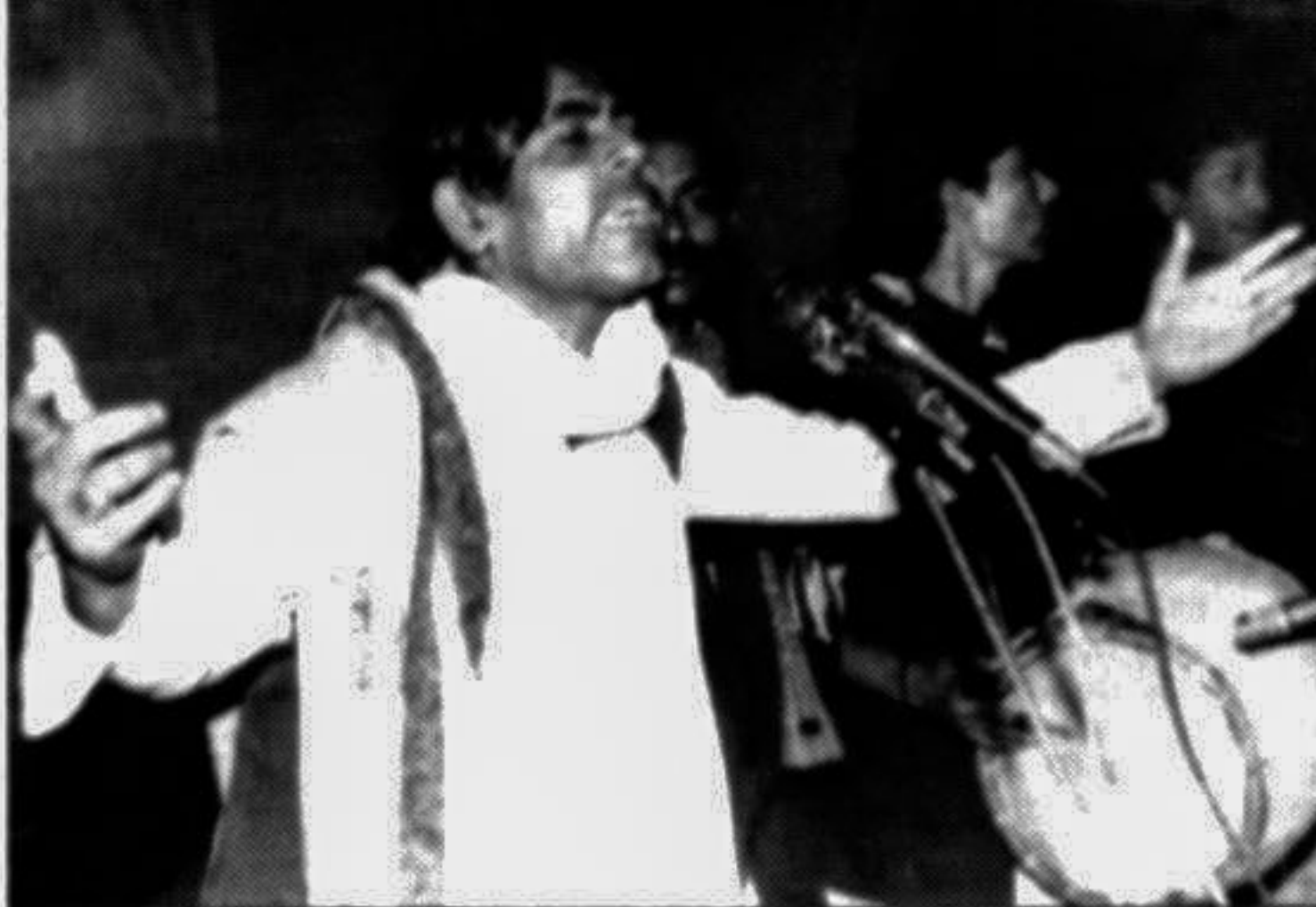
A singer presenting a baul song at a function in the Zainul Abedin Smriti Mancha near TSC on the Dhaka University campus yesterday.