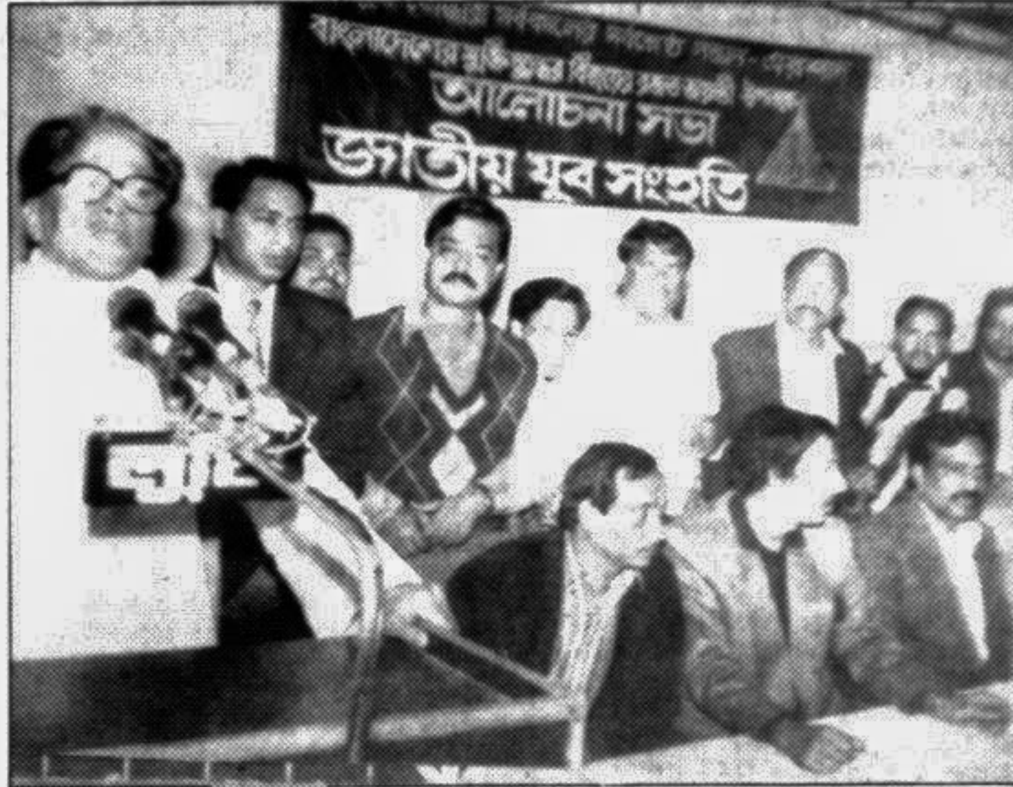
Mizanur Rahman Chowdhury acting Chairman of the Jatiya Party speaking at a discussion organised by the Jatiya Jubo Sanghati at its temporary office in Dhanmondi on the occasion of the Silver Jubilee of Victory Day yesterday.