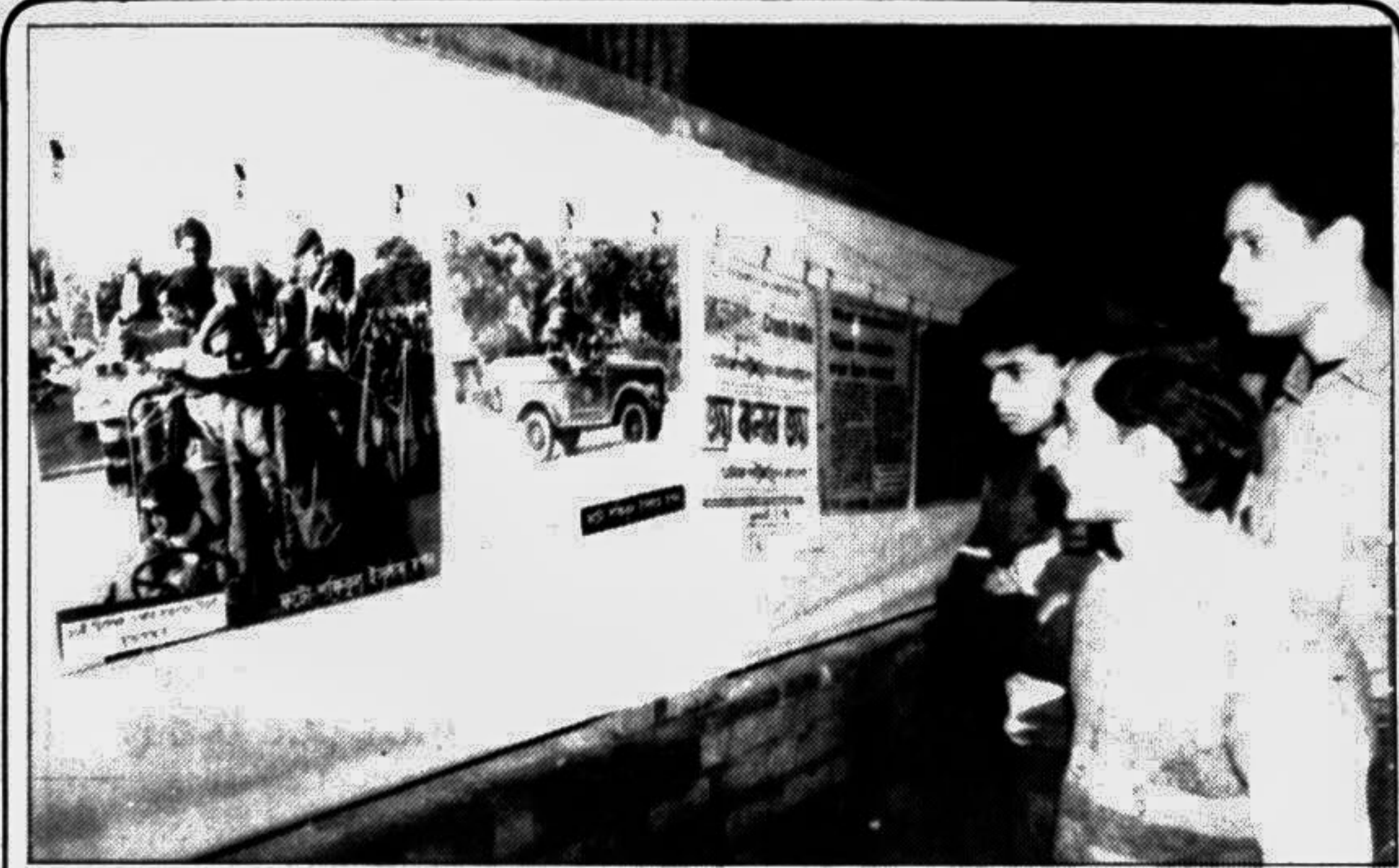
An exhibition of photographs on the War of Liberation by Shafiqul Islam Swapan at the Fine Arts Institute, Dhaka University, yesterday.