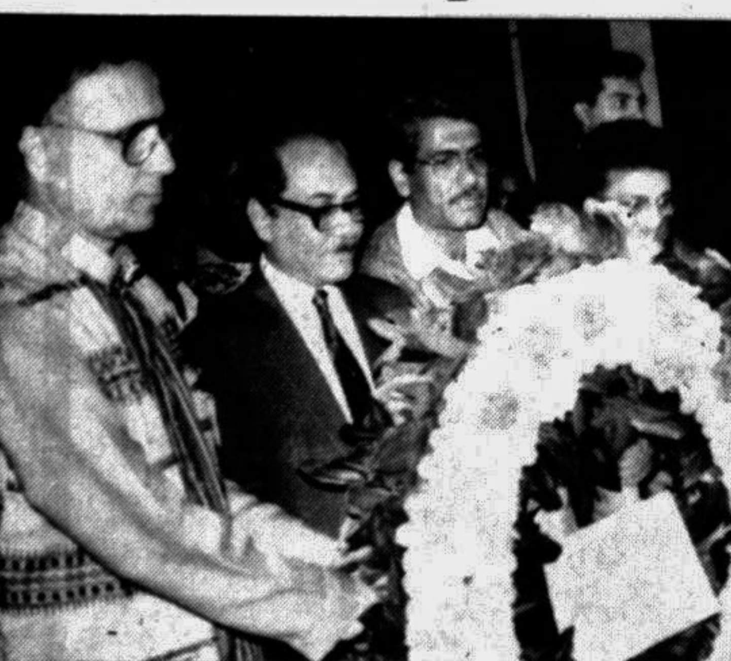
President Shahabuddin Ahmed placing wreaths at the Central Shaheed Minar yesterday.