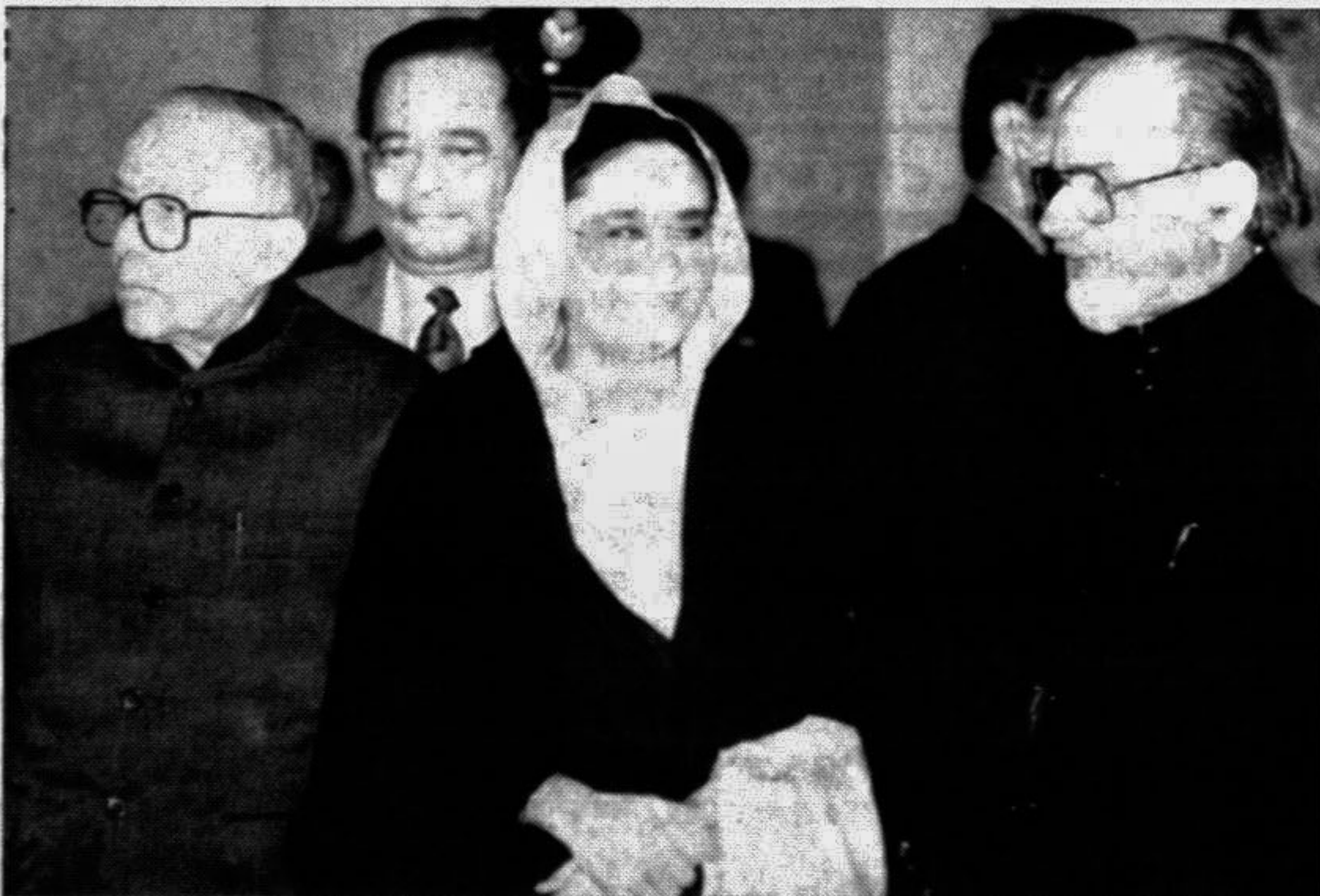
Prime Minister Sheikh Hasina was received by Indian Minister for External Affairs Inder Kumar Gujral (R) and West Bengal Chief Minister Jyoti Basu (L) yesterday on her arrival at the Indira Gandhi International Airport near New Delhi.