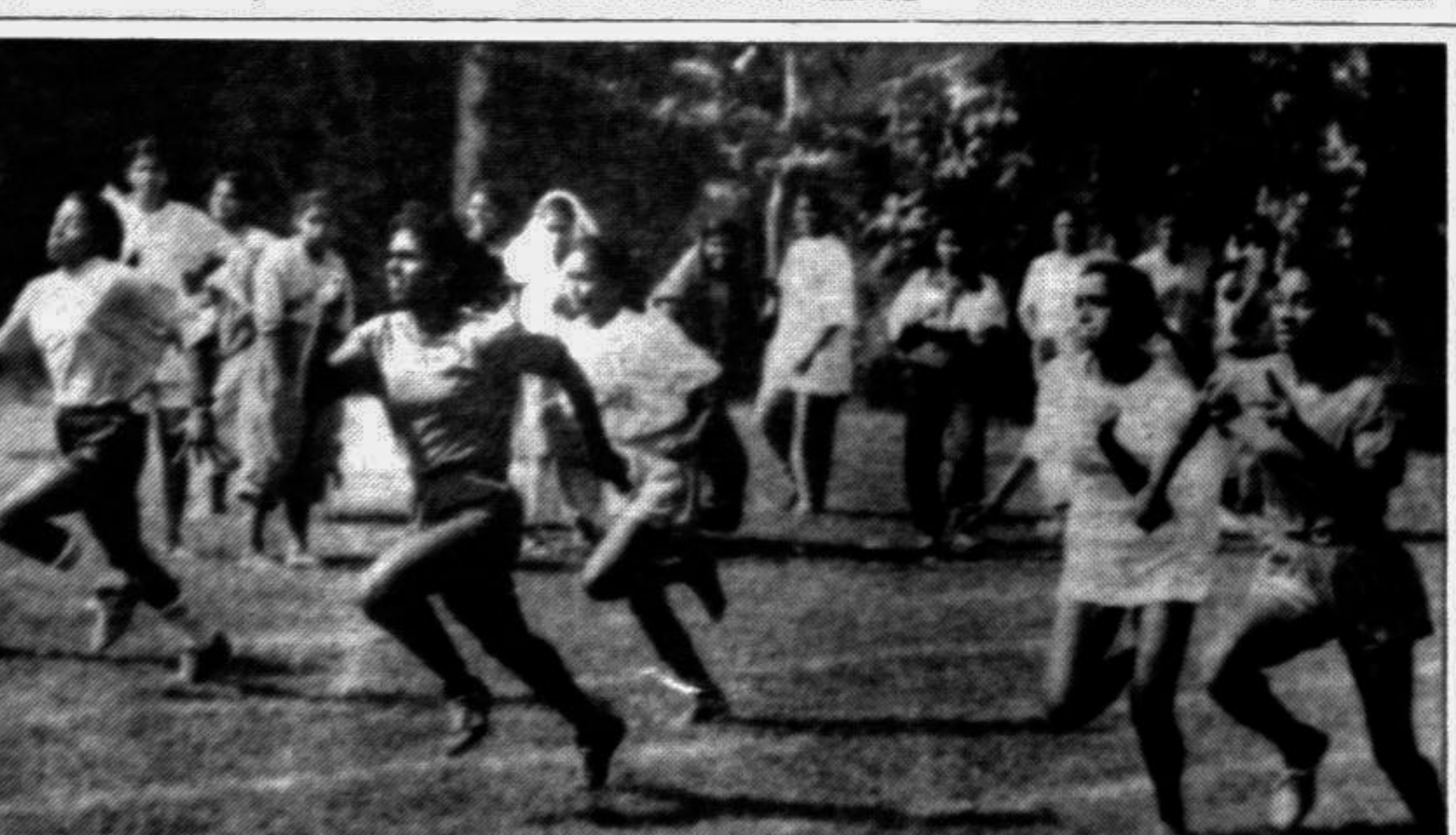
Action from yesterday's 100m sprint of the Bijoy Dibosh open athletic competition at the Dhanmondi Women's Sports Complex.

European Cup survivors Ajax were held 1-1 by 10-man AZ Alkmaar on Sunday, having seemed set for maximum points after moving ahead in the 11th minute when Arno Splinter's shot deflected into goal and Alkmaar's Danny Hesp was sent off for bringing down Nordin Wooter after 30 minutes.