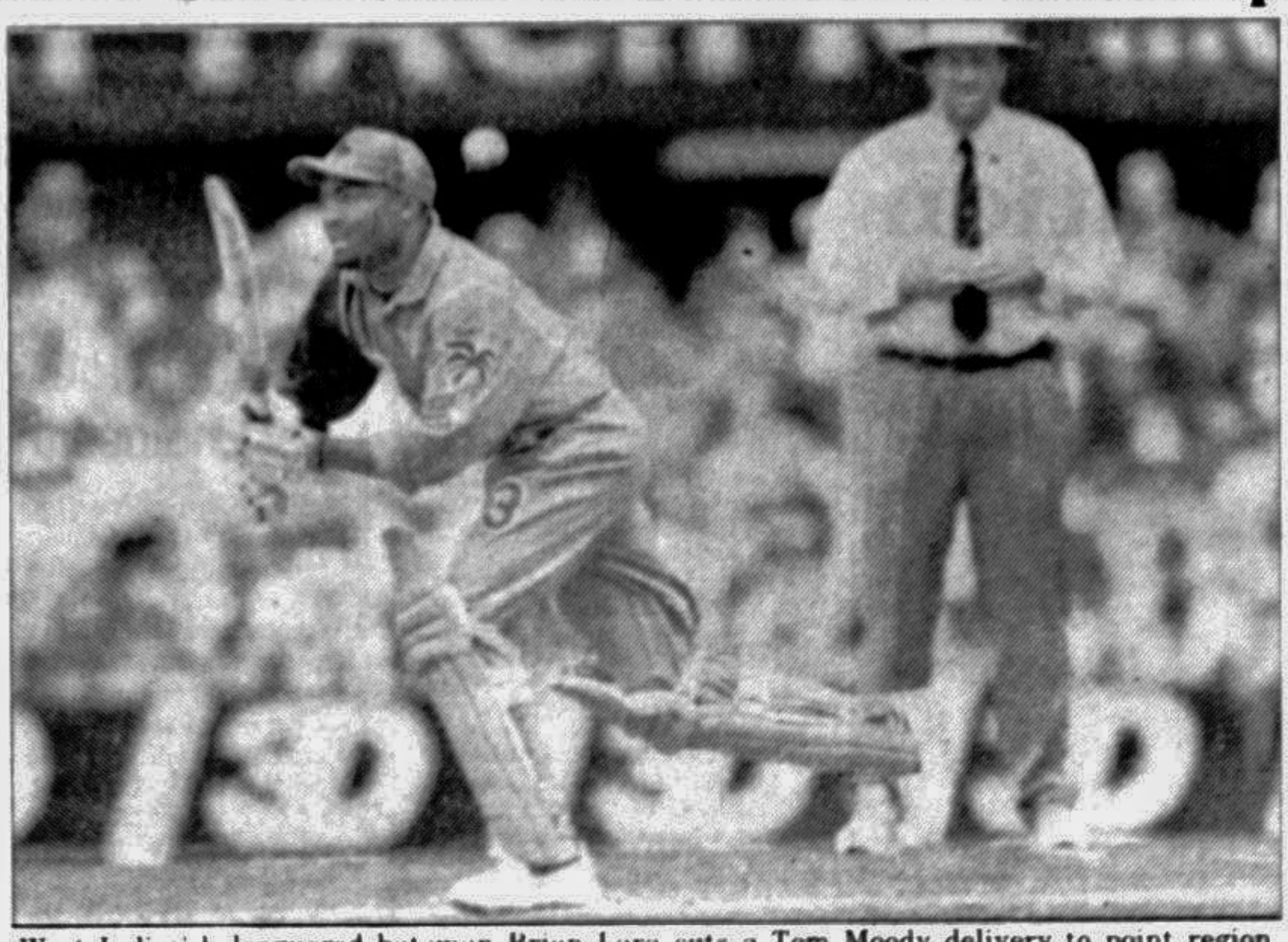
West Indies beleaguered batsman Brian Lara cuts a Tom Moody delivery to point region while umpire Daryll Hair looks on during the second World Series tie against Australia at the Sydney Cricket Ground yesterday.

Vasquez keeps his belt PALM SPRINGS, California, Dec 8: Wilfredo Vasquez of Puerto Rico pummeled Bernardo Mendoza of Chile into submission on Saturday to retain his World Boxing Association (WBA) featherweight title, reports Reuter.