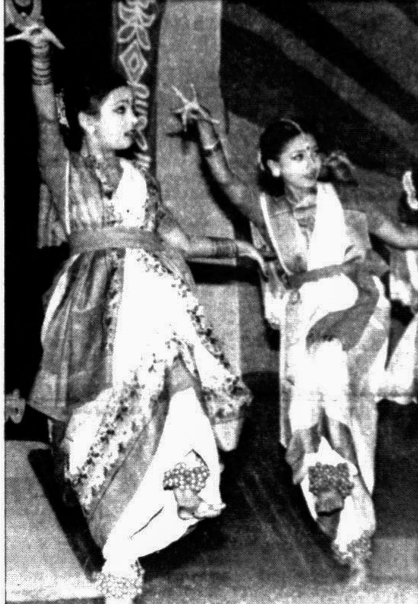
Sequence of a dance organised by the Joy Bangla Sangskritik Jote at Ramna Batamul in the city yesterday marking the Silver Jubilee of Independence.