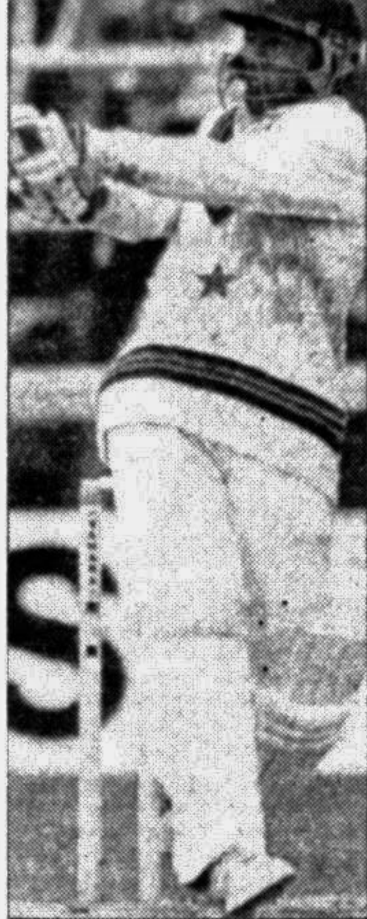
SAEED ANWAR ... m-o-m

New Zealand were on 146, no other Kiwi batsman could stand up to the Pakistani attack.