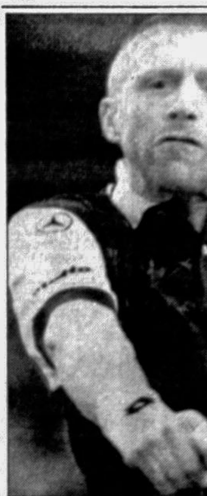
Boris Becker of Germany plays a backhand during his quarterfinal engagement against Swiss Jakob Hlasek in the Munich Grand Slam Cup on Dec 5. Becker won 6-4, 6-1.

GUWAHATI, Dec 6: The 16th junior national women's cricket championship will begin here from December 15, reports PTT.