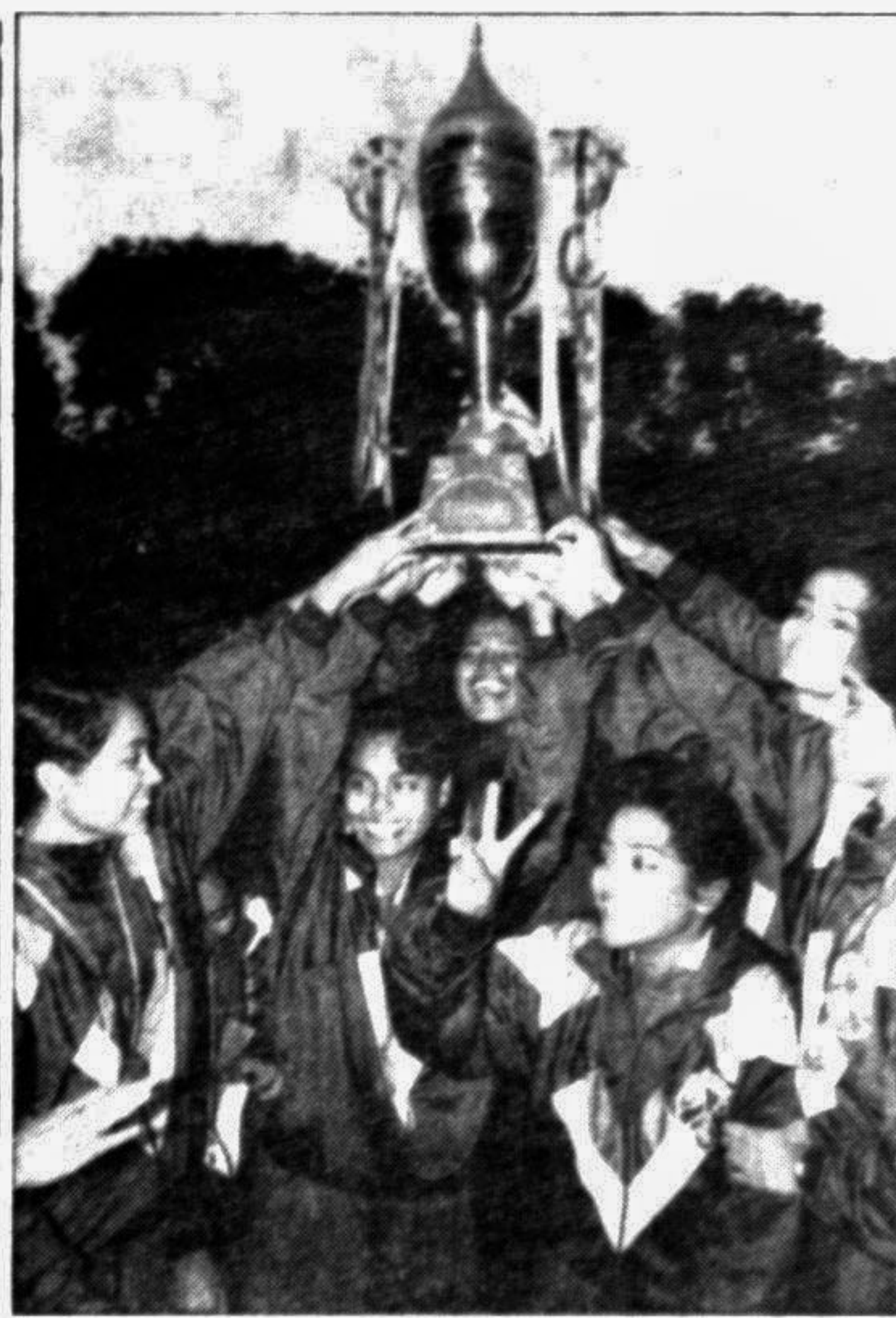
The jubilant Shamsunnahar Hall team members show off the Delta Life inter-hall college women's sports trophy after the final at the Dhanmondi Women's Sports Complex yesterday.

Scores: England 197 and 180, Mashonoland 280 and 98-3.