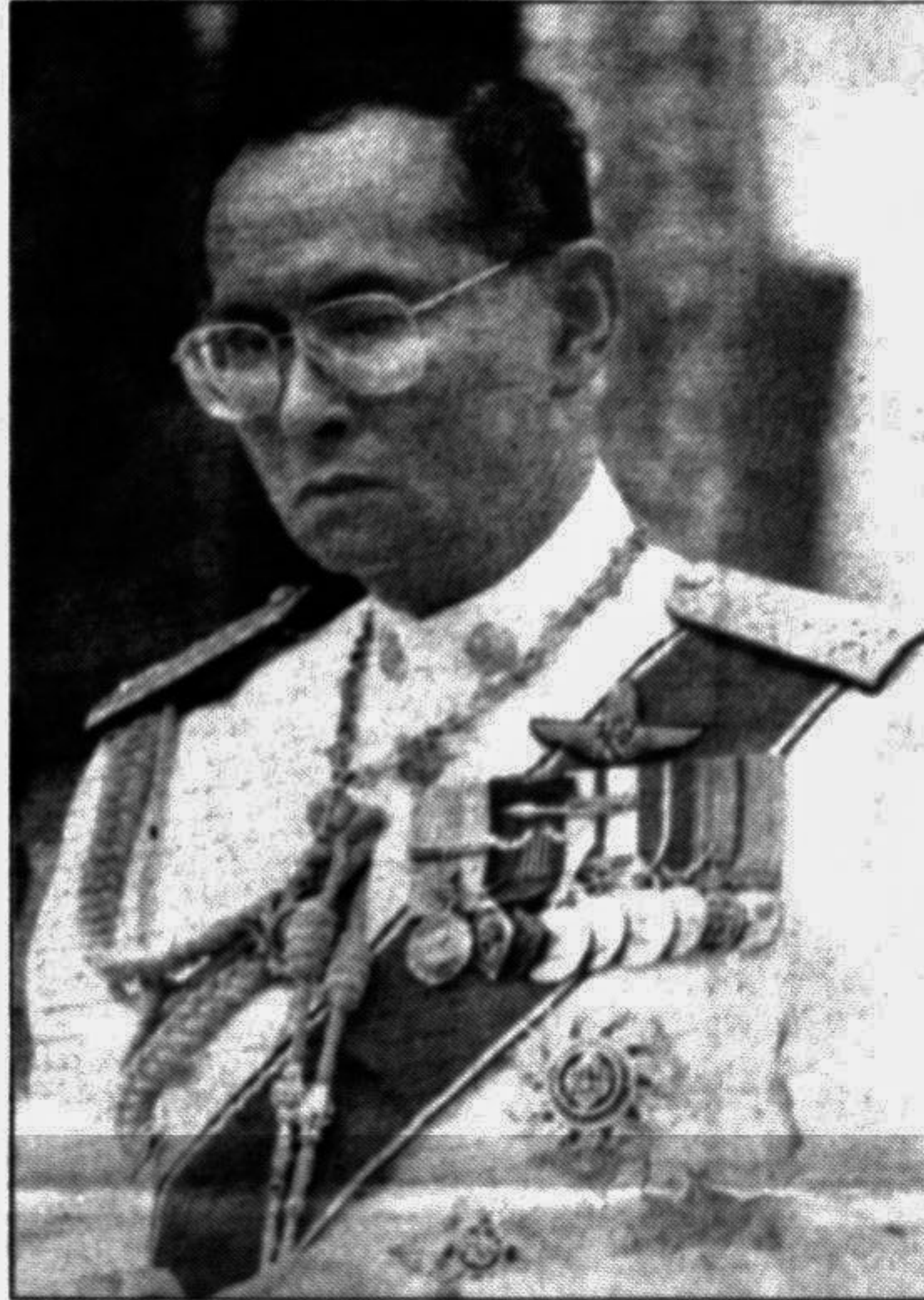
His Majesty King Bhumibol Adulyadej