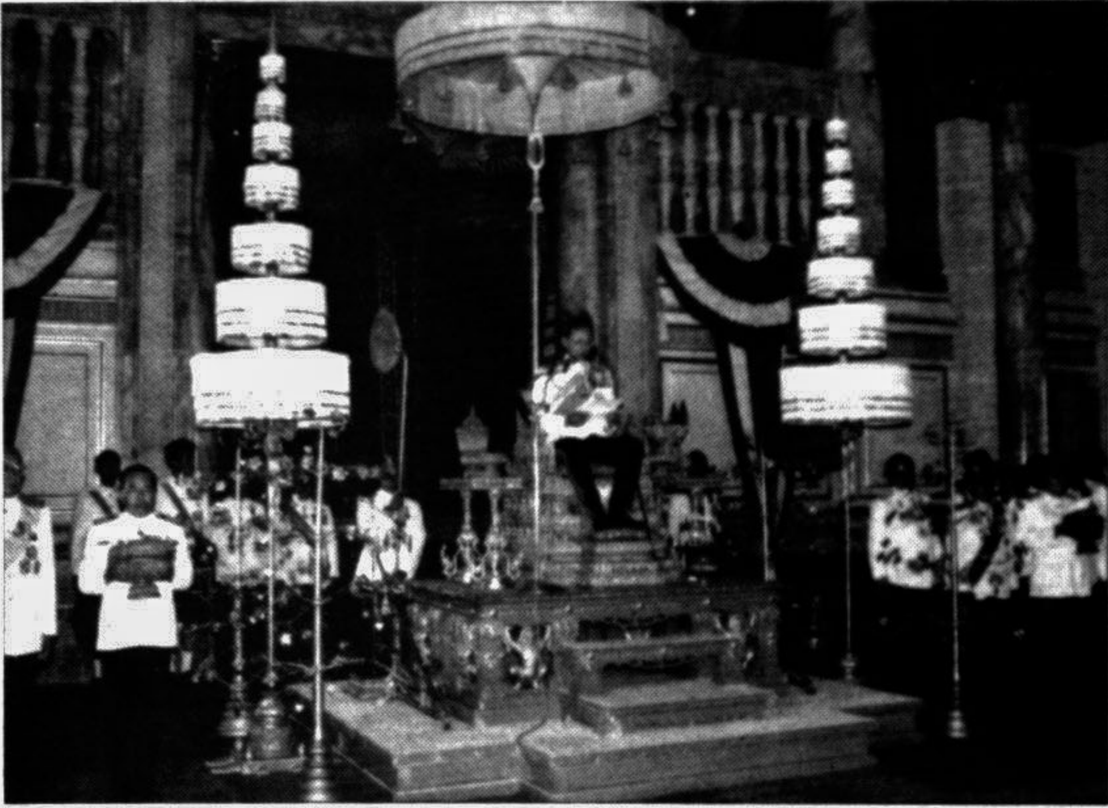
4 August 1986: His Majesty the King giving a Royal Address on the occasion when His Majesty presided over the Opening Ceremony of the National Assembly, at Ananta Samakhom Throne Hall, Dusit Palace.