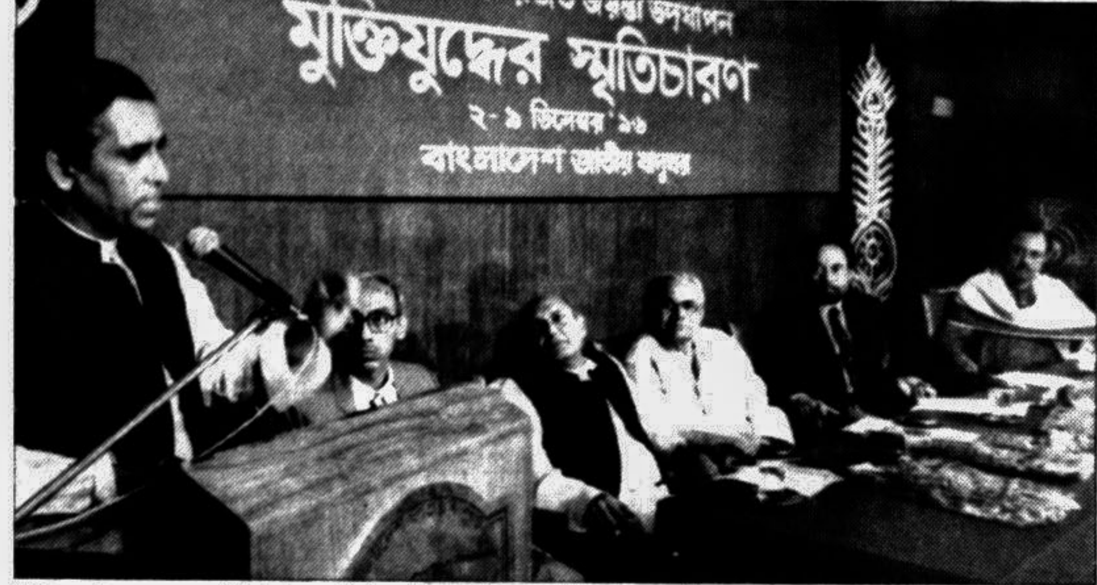
Water Resources Minister Abdur Razzak speaking at a discussion on 'Reminiscence of the Liberation War' at the National Museum auditorium in the city yesterday.