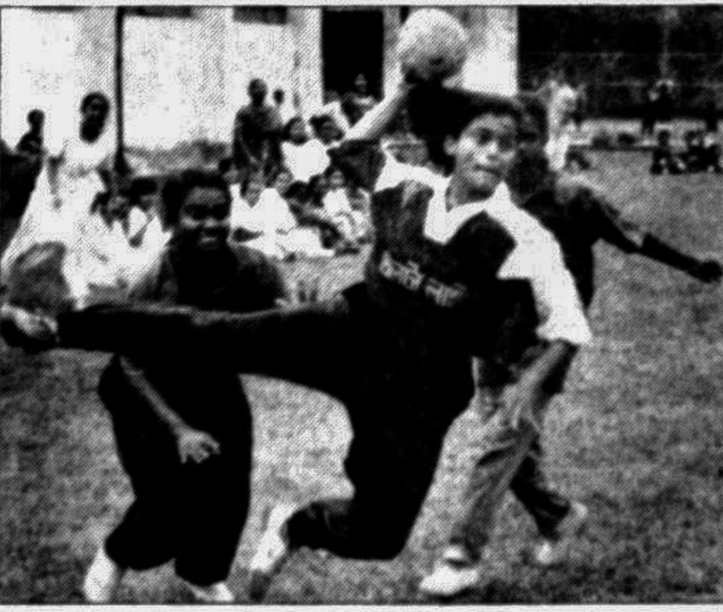
Action from yesterday's Delta Life inter-college eves' handball semifinal match between Viquarunnissa and Holy Cross at the Dhanmondi Sports Complex.

The FedEx Bangladesh squash championship, by the Bangladesh Squash Rackets Federation, will begin at the Dhaka Club squash complex from December 18, says a press release. Interested competitors have been requested to enlist their names with the squash marker of Dhaka Club by December 12 evening.