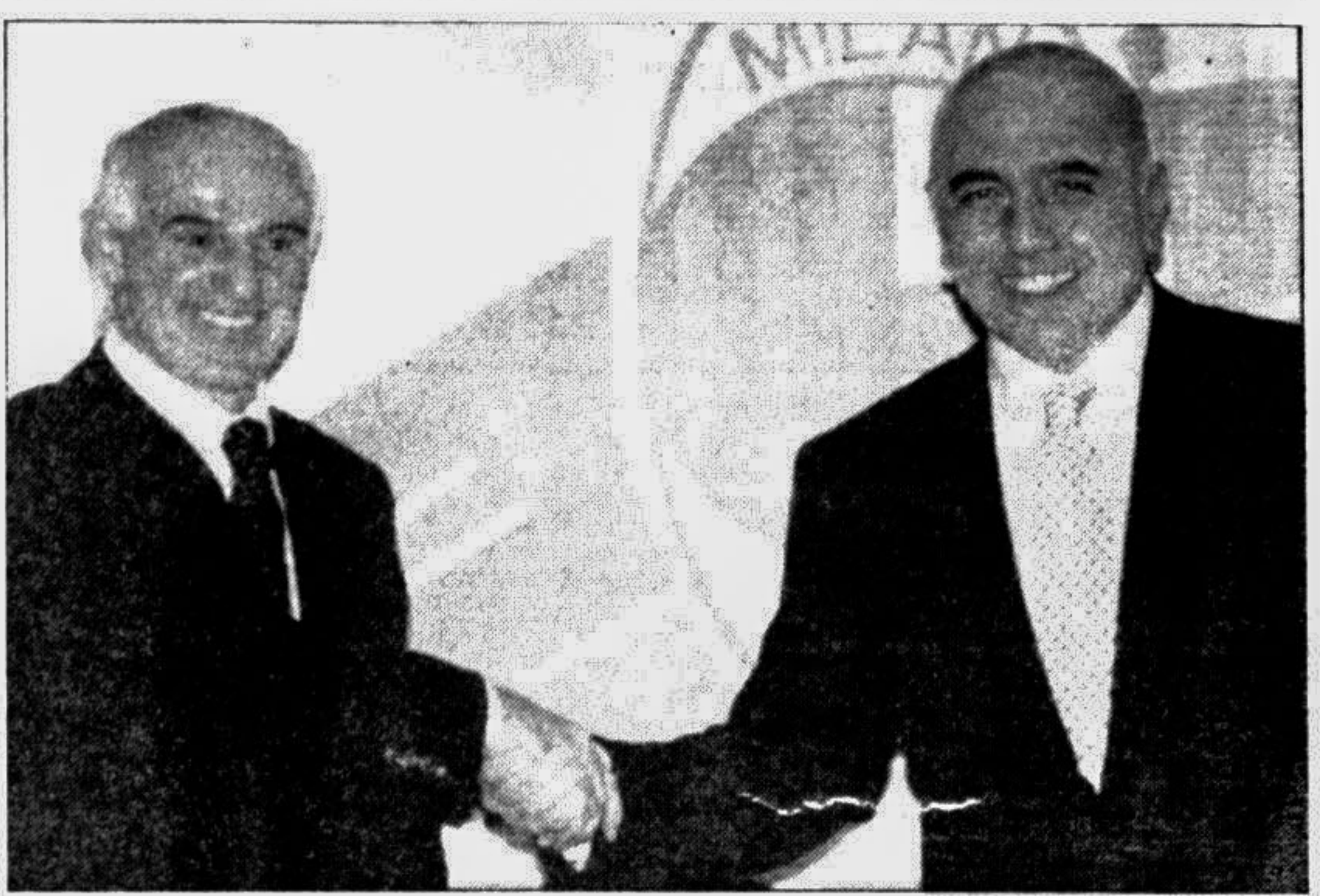
AC Milan vice-president Adriano Galliani (R) and their new coach Arrigo Sacchi shake hands during a press conference in Milan on Dec 2. Sacchi returned to the club after quitting Italian national team on the day before.