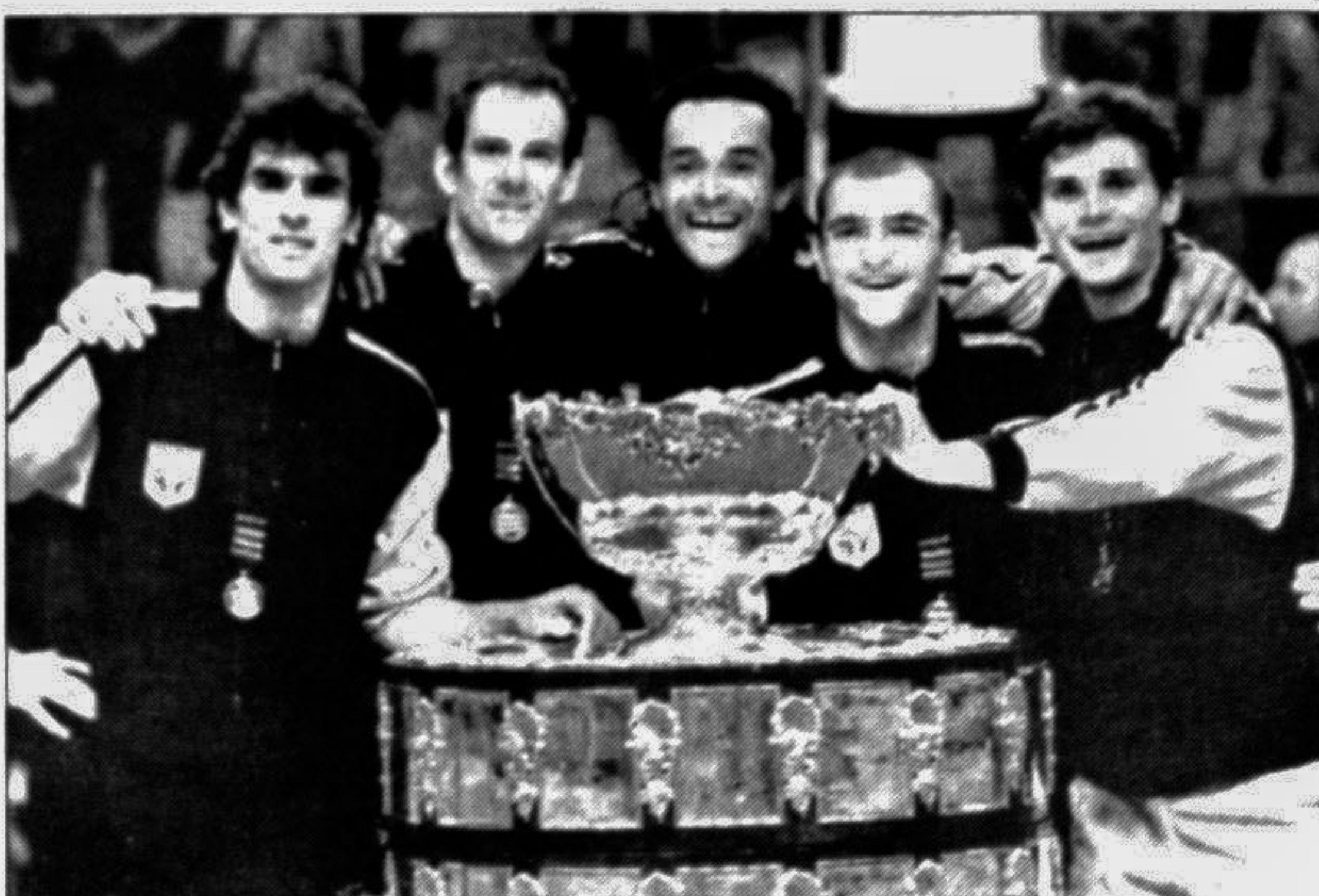
The victorious French Davis Cup team (L to R), Cedric Pioline, Guy Forget, Yannick Noah (captain), Guillaume Raoux and Arnaud Boetsch, hold the cup after beating Sweden at the Malmomassan Stadium on Dec 1. France won the series 3-2.