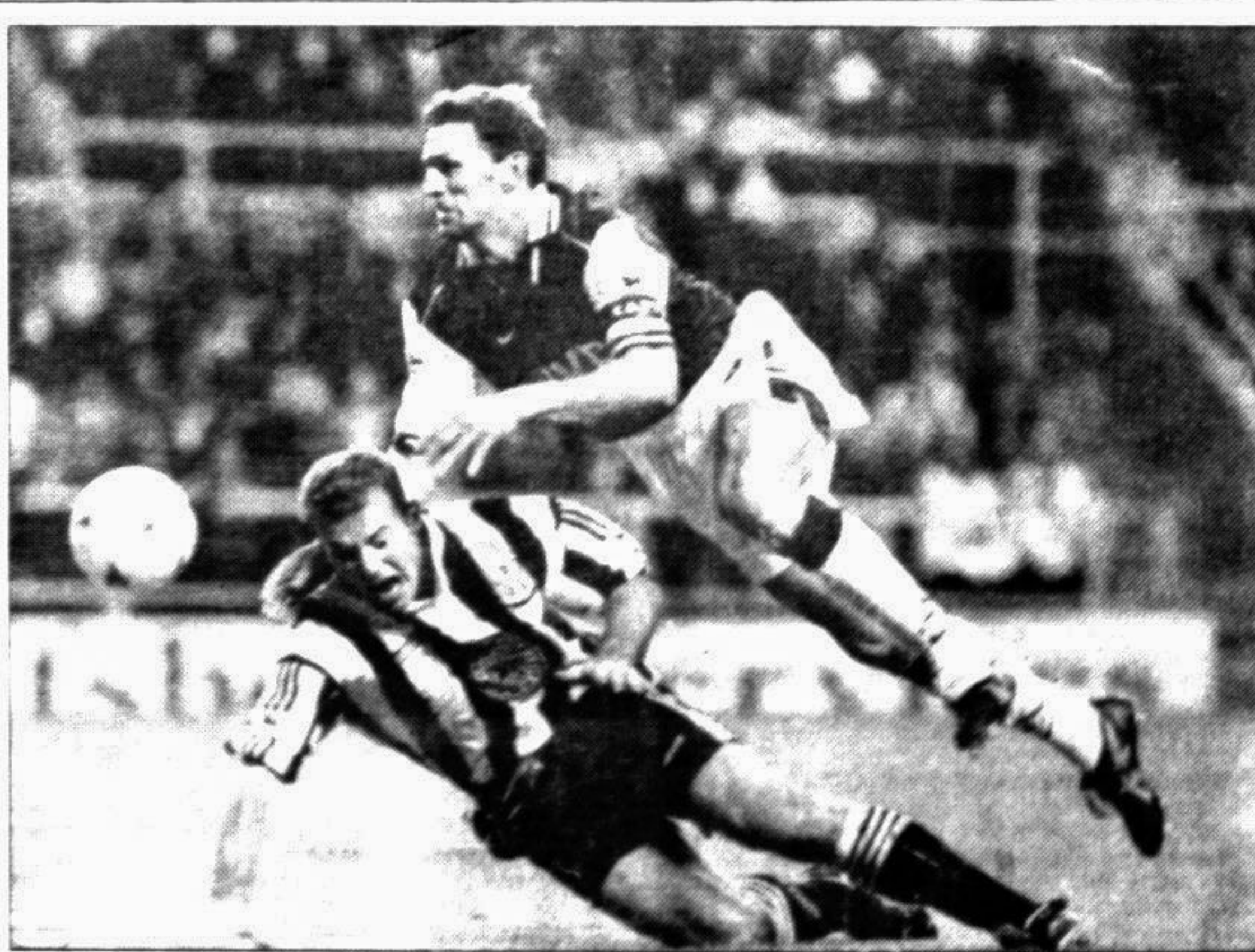
Newcastle striker Alan Shearer (down) seen grappling with Arsenal captain Tony Adams during their Premiership match at St James' Park on Nov 30. Arsenal won 2-1.