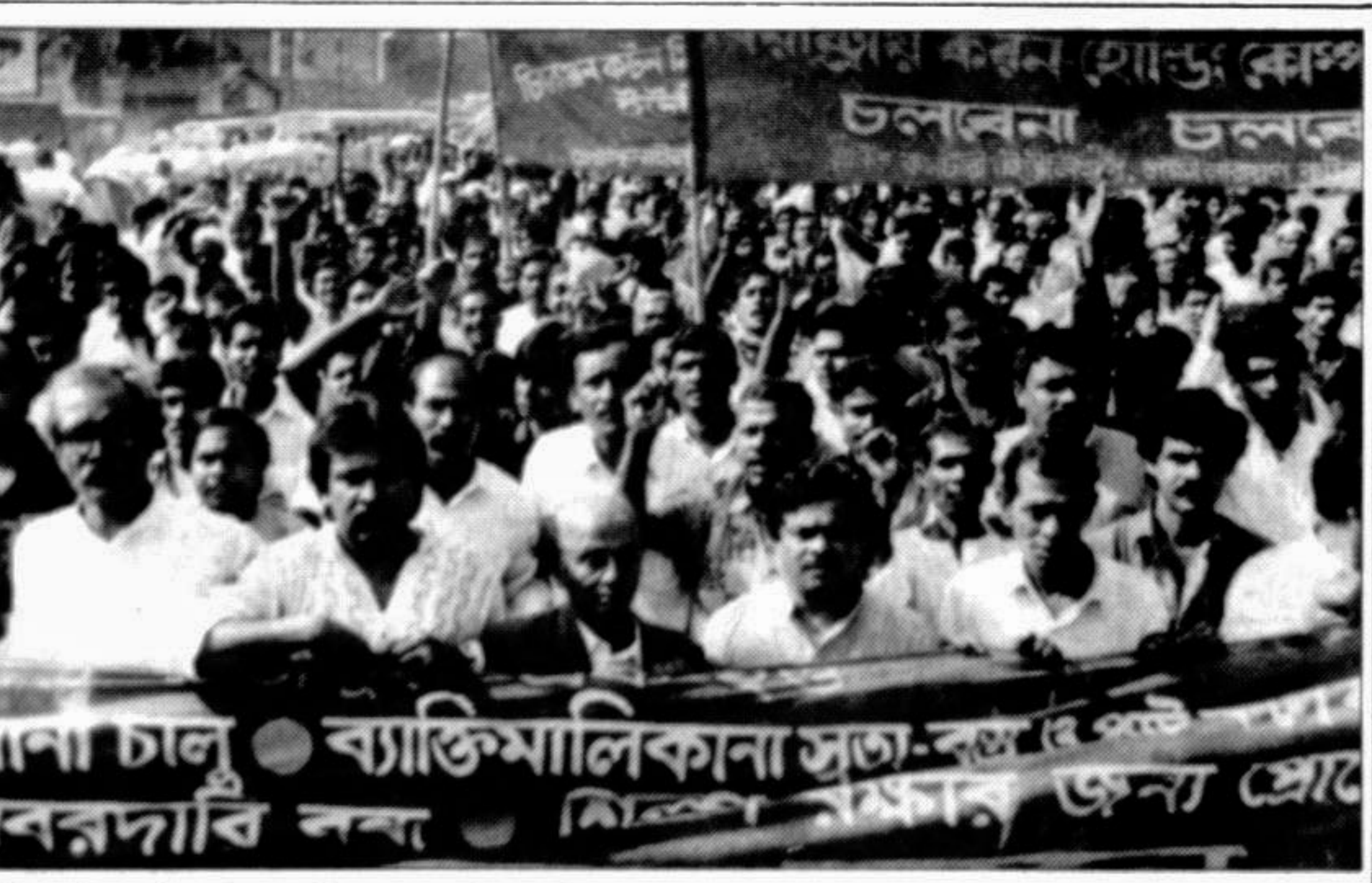
Textile and industrial workers brought out a procession in the city yesterday demanding immediate reopening of closed mills and realisation of their 10-point demand.