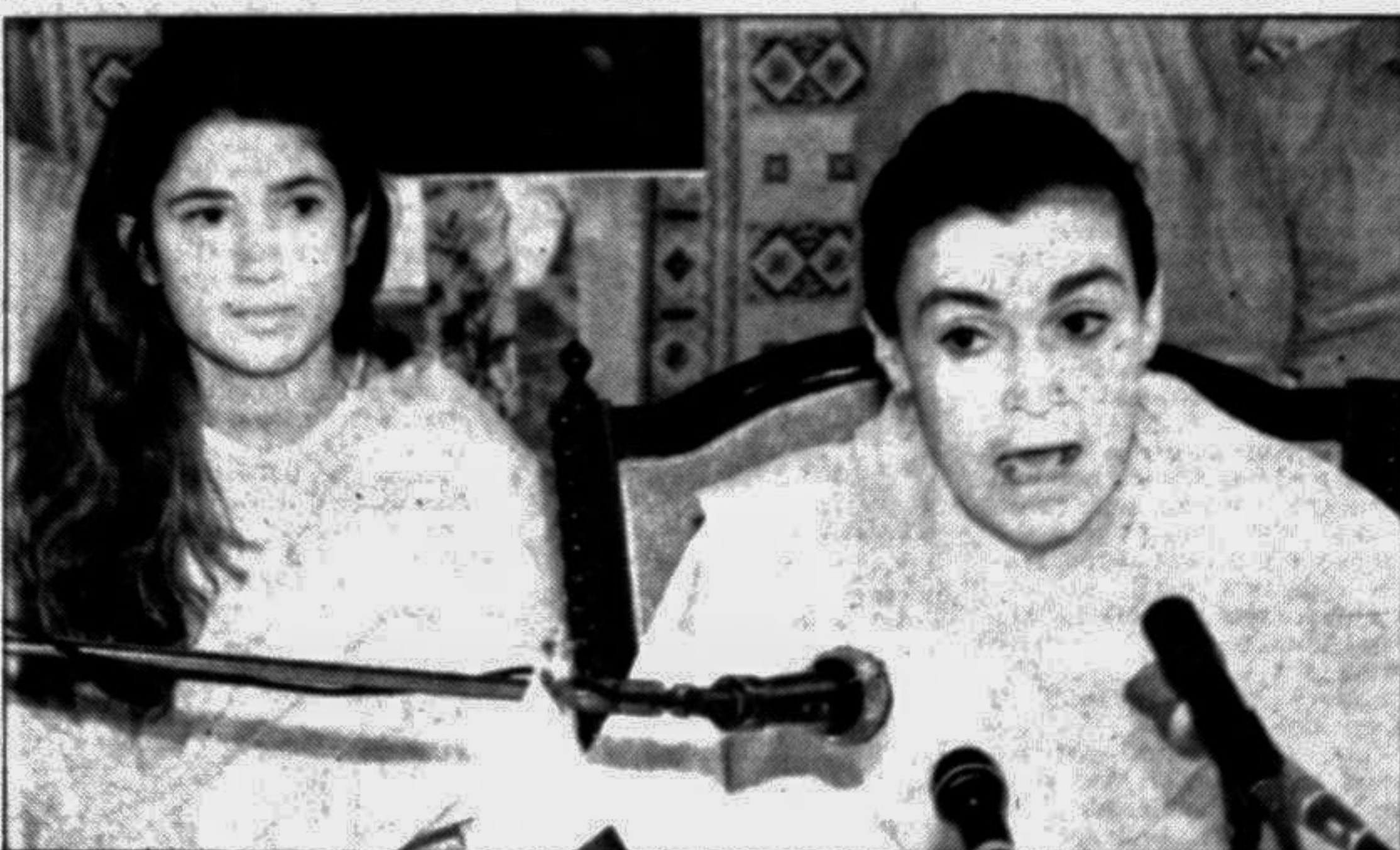
Ghinva Bhutto (R), widow of Murtaza Bhutto, announced that she will replace her slain husband as leader of the Pakistan People's Party faction (PPP) at a press conference in Karachi yesterday as her daughter Fatima (L) looks on.

PLEASE CONTACT: BANGLADESH AIR EXPRESS INT'L LTD. Fax: 9565112, Gulshan: 87771, Chittagong: (031) 712127, Khulna: (041) 25008