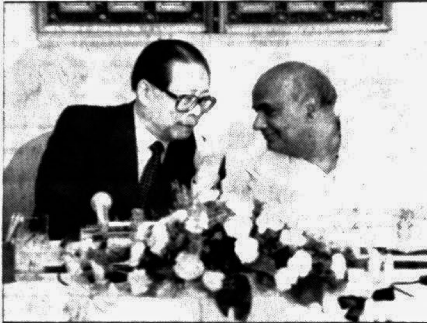
Chinese President Jiang Zemin (L) and Indian Prime Minister H D Deve Gowda confer during a signing of agreements ceremony yesterday in New Delhi.

NEW DELHI, Nov 29: India and China today agreed to cut troops on their border, reports AFP.