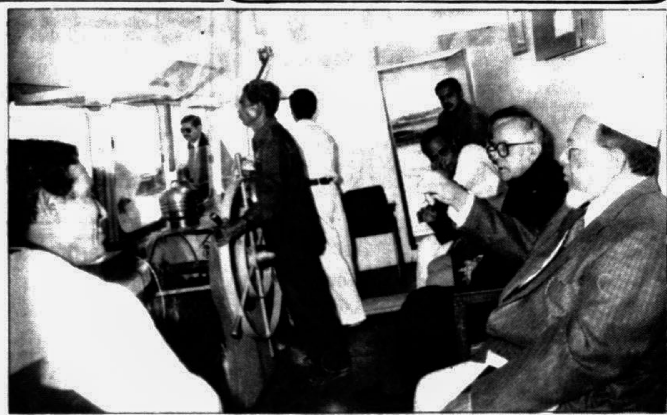
Visiting West Bengal Chief Minister Jyoti Basu enjoying a river cruise in the Buriganga and Meghna on board the BPC's Eagle-2 vessel yesterday. Foreign Minister Abdus Samad Azad and Water Resources Minister Abdur Razzak are also seen.

The West Bengal Chief Minister, whose ancestral home in the small hamlet, 'Barodi' in Narayanganj district is not far from the banks of the rivers, was visibly carried away by early days memories as he... See Page 12 Col 7