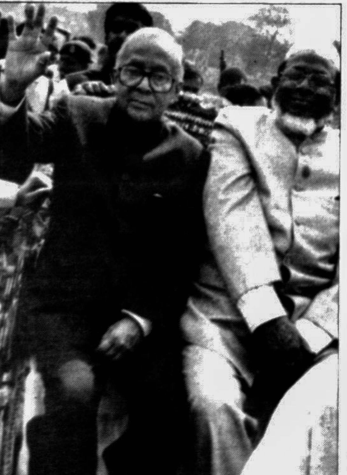
Foreign Minister Abdus Samad Azad sharing a rickshaw with Jyoti Basu on his way back to helpalad after visiting his ancestral home at Barodi yesterday.