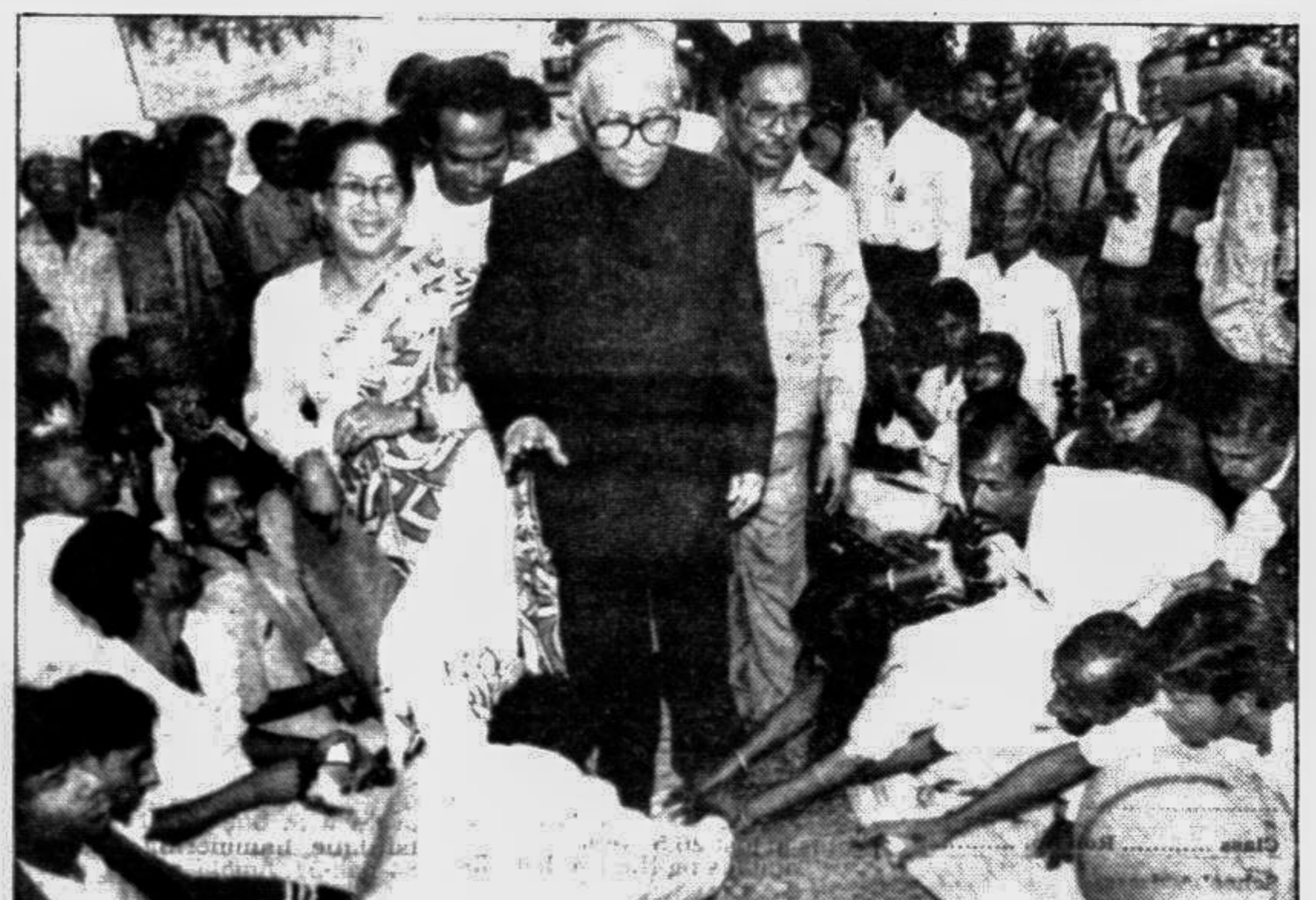
Jyoti Basu greeted by devotees at the Loknath Brahmachari Ashram at Barodi yesterday.