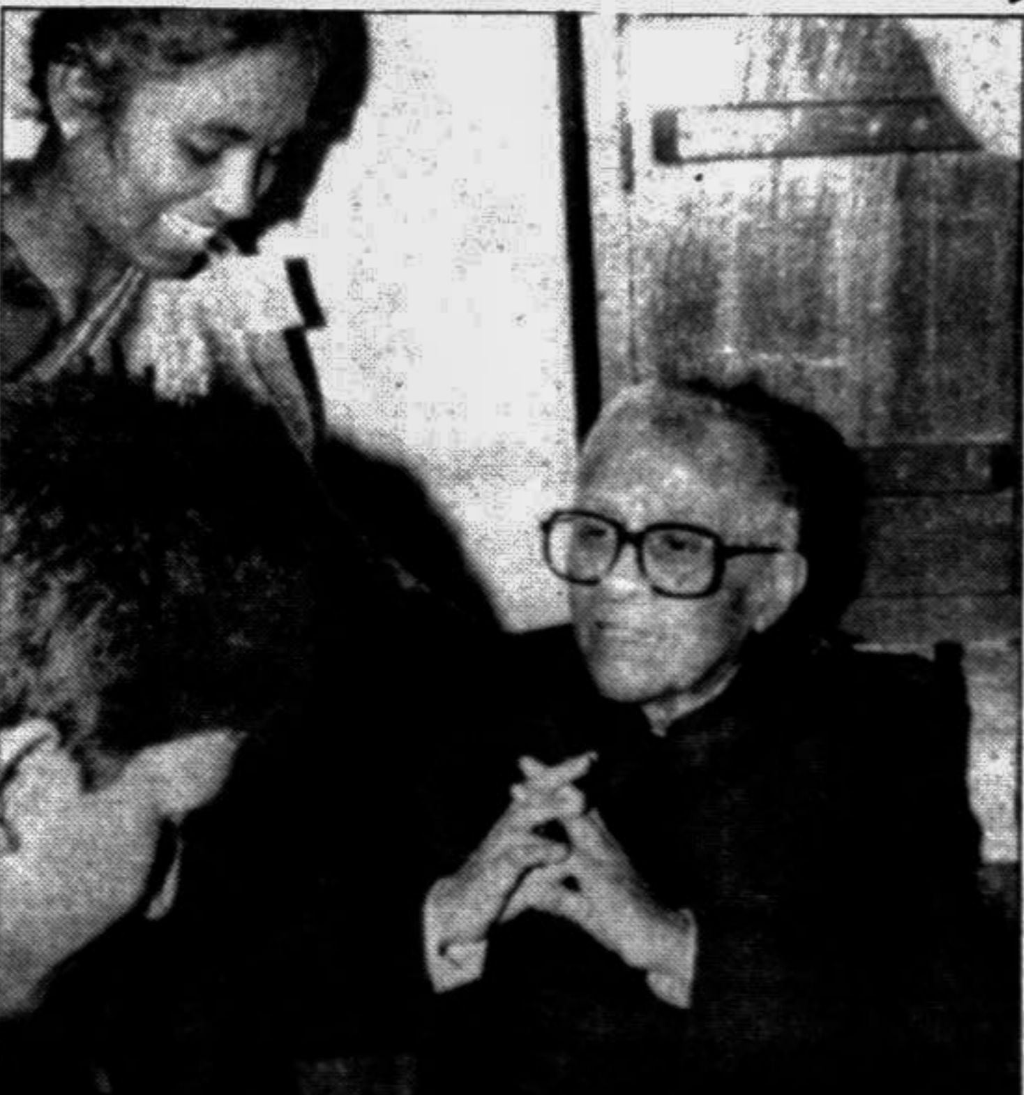
Jyoti Basu talking to the family of caretaker of his ancestral home at Barodi yesterday.