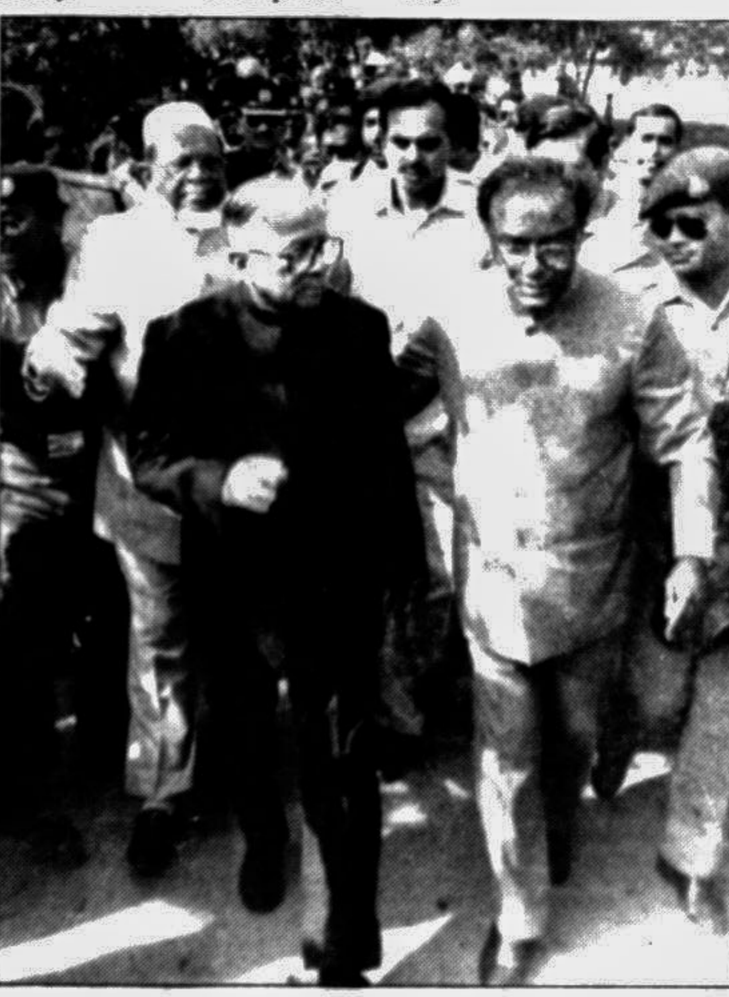
Jyoti Basu, accompanied by Foreign Minister Abdus Samad Azad (on his back) and West Bengal Finance Minister Asim Dasgupta (on his left) on his way to his ancestral home at Barodi yesterday.