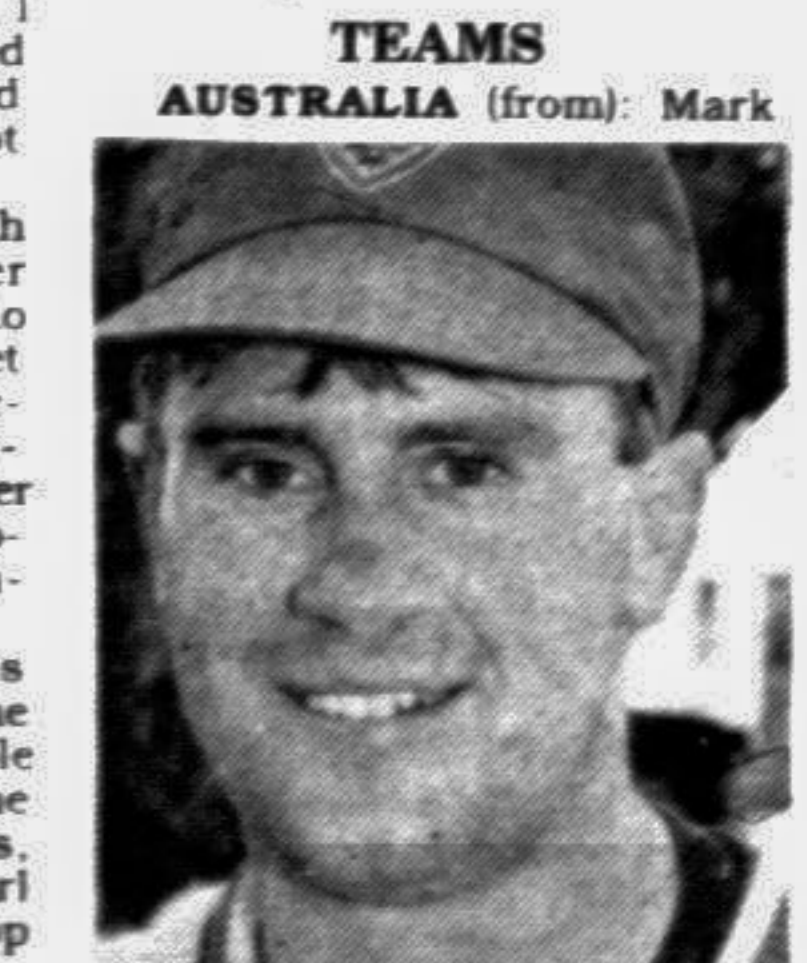
MARK TAYLOR Taylor (captain), Matthew Elliott, Ricky Ponting, Mark Waugh, Greg Blewett, Michael Bevan, Ian Healy, Shane Warne, Paul Reiffel, Glenn McGrath, Michael Kasprovic, Jason Gillespie, Peter McIntyre.

WEST INDIES (from): Sherwin Campbell, Robert Samuels, Brian Lara, Shivnarine Chanderpaul, Carl Hooper, Jimmy Adams, Courtney Browne, Ian Bishop, Curtly Ambrose, Kenny Benjamin, Courtney Walsh (captain), Nixon McLean.