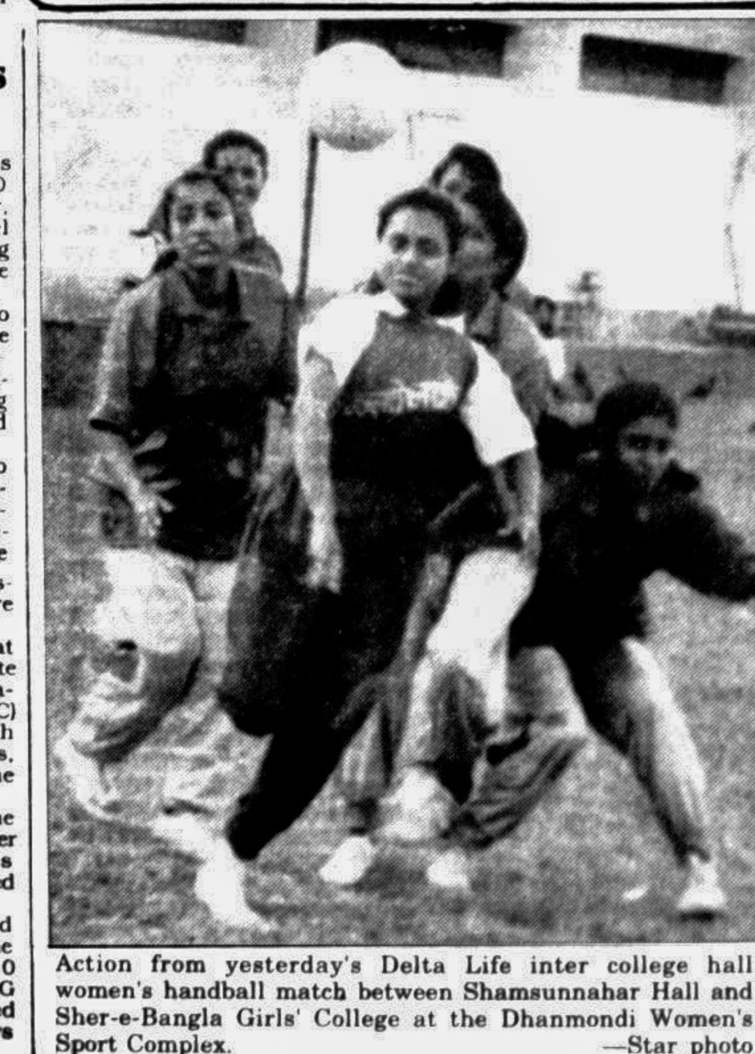
Action from yesterday's Delta Life inter college hall women's handball match between Shamsunnahar Hall and Sher-e-Bangla Girls' College at the Dhanmondi Womens Sport Complex.

GABRIELA SABATINI escape the pressure and loneliness of fame, reports Reuter. "Often enough I cried when I lost a match, but I could cope with that..."