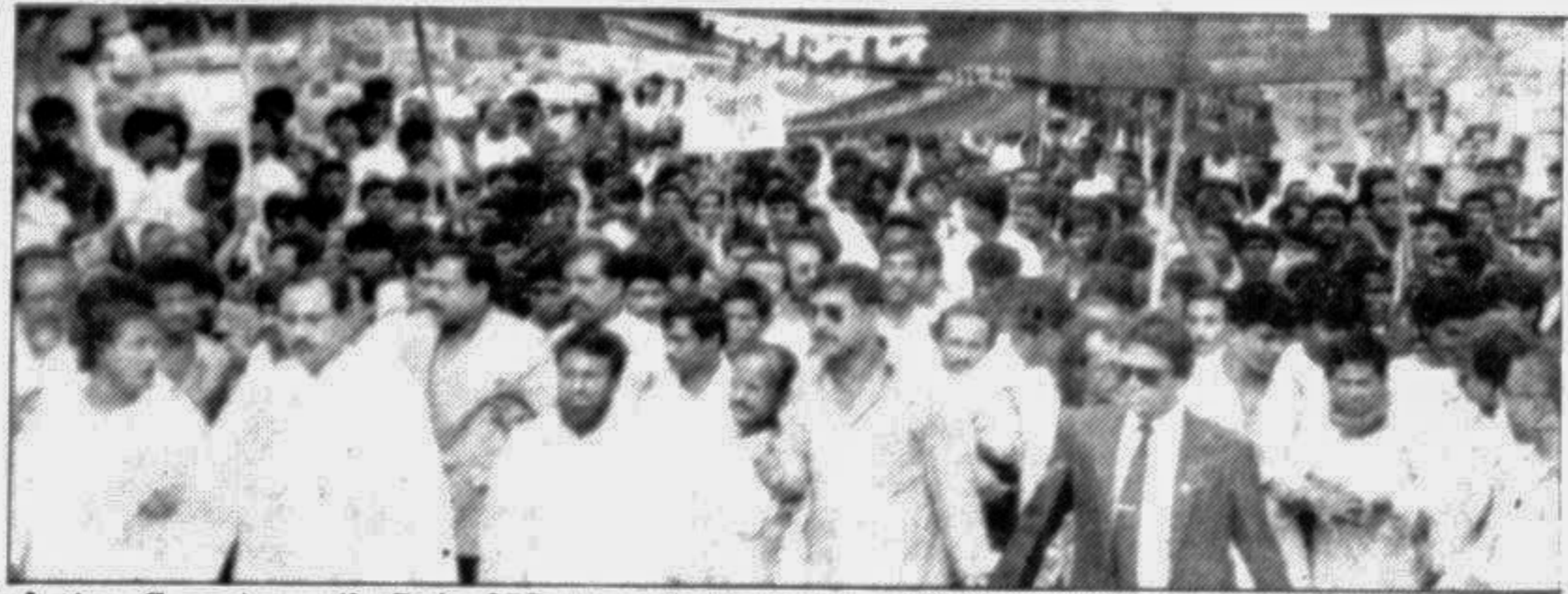
Jatiya Samajtantrik Dal (JSD) brought out a procession in the city yesterday on the occasion of its national convention.

— Theatre: Habib Tanvir. Venue: Shilpakala Academy auditorium. Time: 6:30 pm.