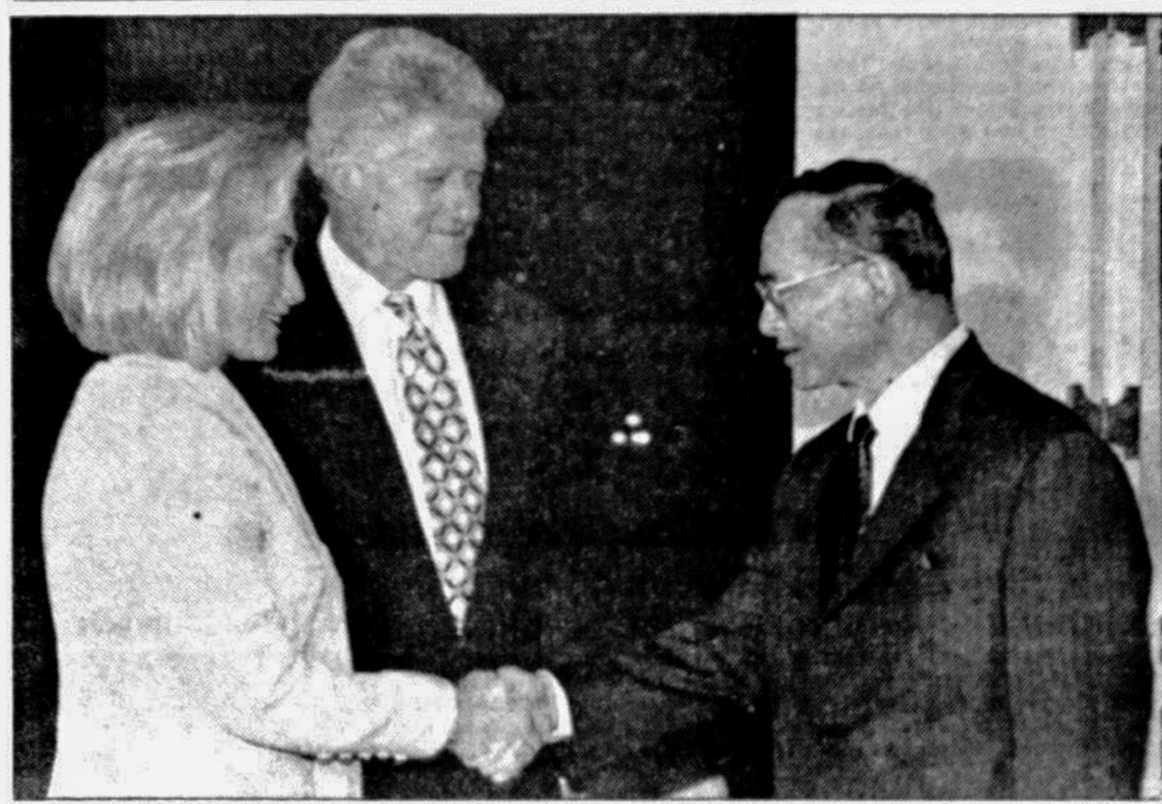
Thai King Bhumibol Adulyadej (R) welcomes US President Bill Clinton and First Lady Hillary Clinton at Chitlada Palace on Monday. Clinton was on a 26-hour trip to Thailand, the first by an American President in 27 years.

PLEASE CONTACT BANGLADESH AIR EXPRESS INT'L LTD. Head Office: 9585114, Fax: 9565112, Gulshan: 987771, Chittagong: (031) 712127, Khulna: (041) 25008