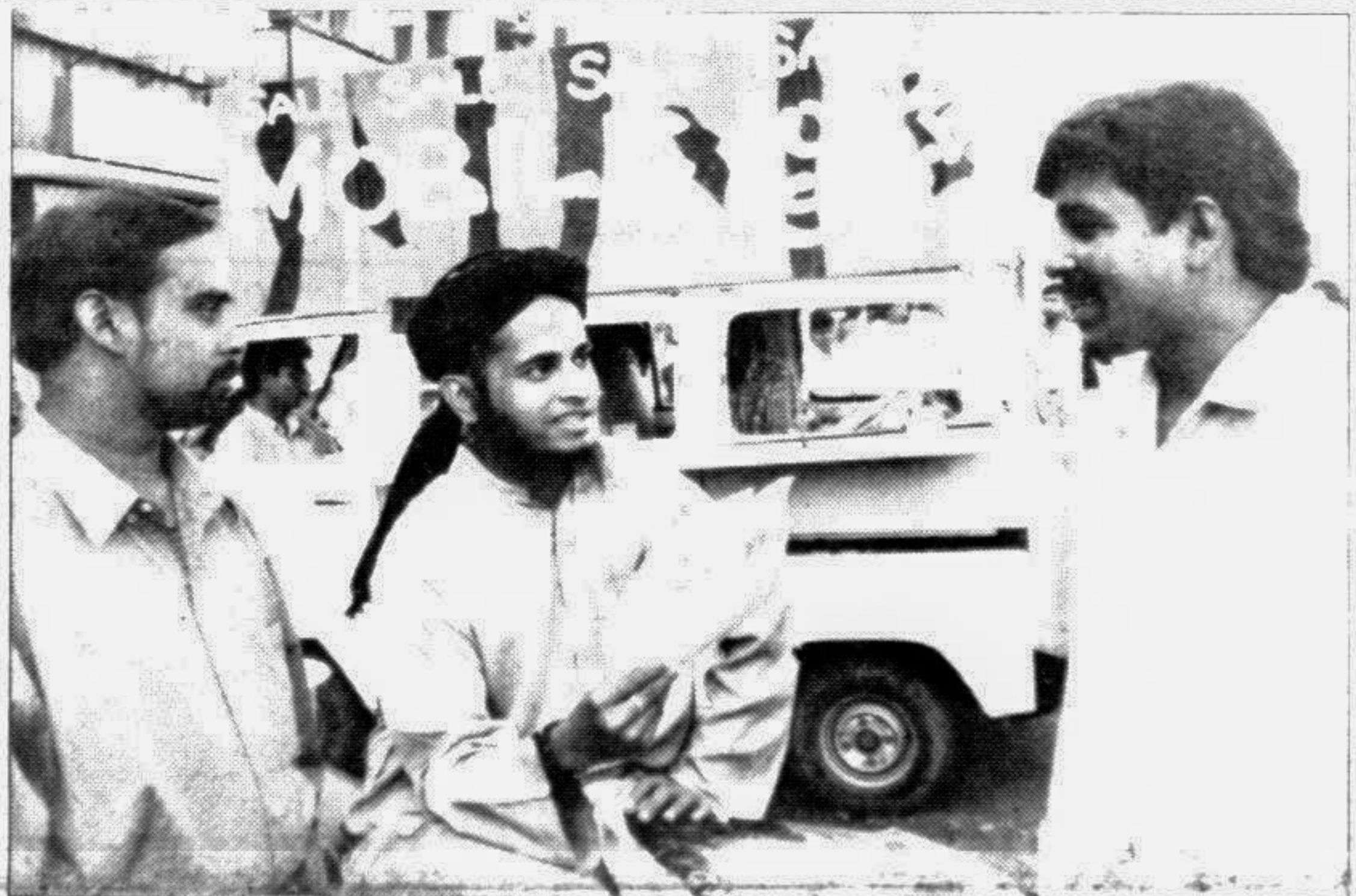
A kerb market trader trying to sell some share certificates near the DSE building at Motijheel in the city yesterday.

The local people alleged that Millan, a terror of the area came to collect toll from a grocer. But he snatched Tk 3000 See Page 12 col 5