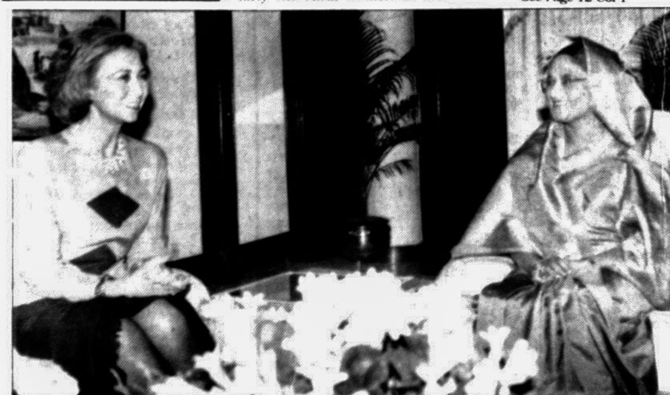
Spanish Queen Sophia called on Prime Minister Sheikh Hasina at State Guest House Jamuna in the city yesterday.