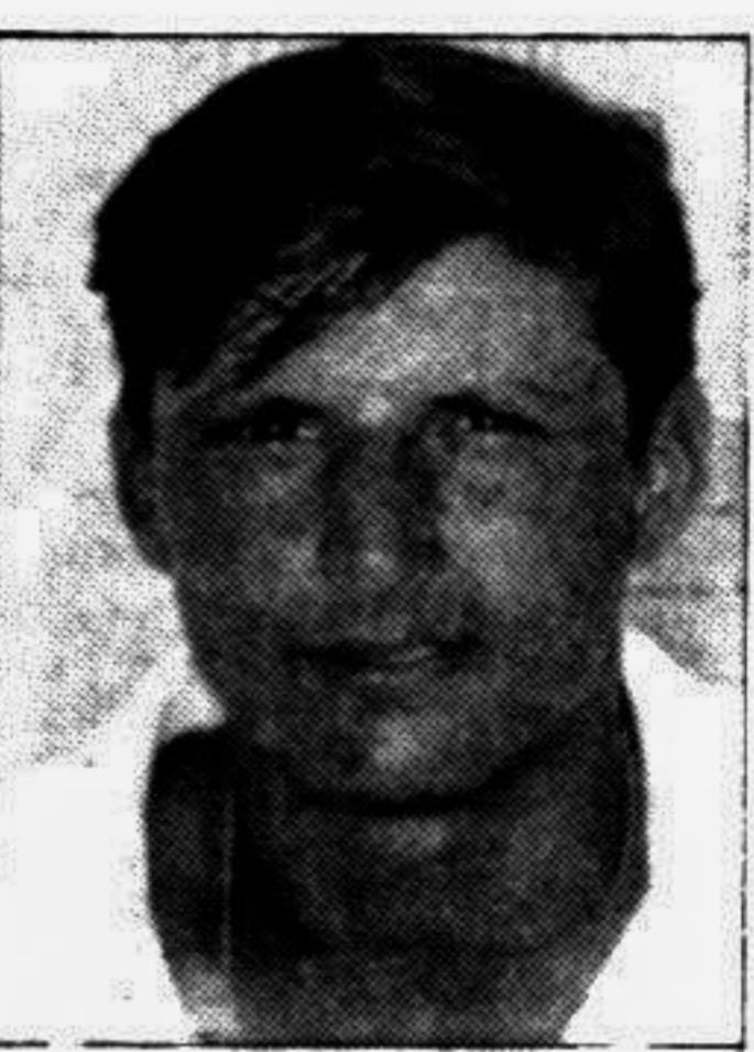
Shahid Afridi (Pakistani cricketer) "I borrowed a bat from Waqar Younis and took the opportunity after the first wicket fell."

Commenting on his fastest hundred in one-dayers.