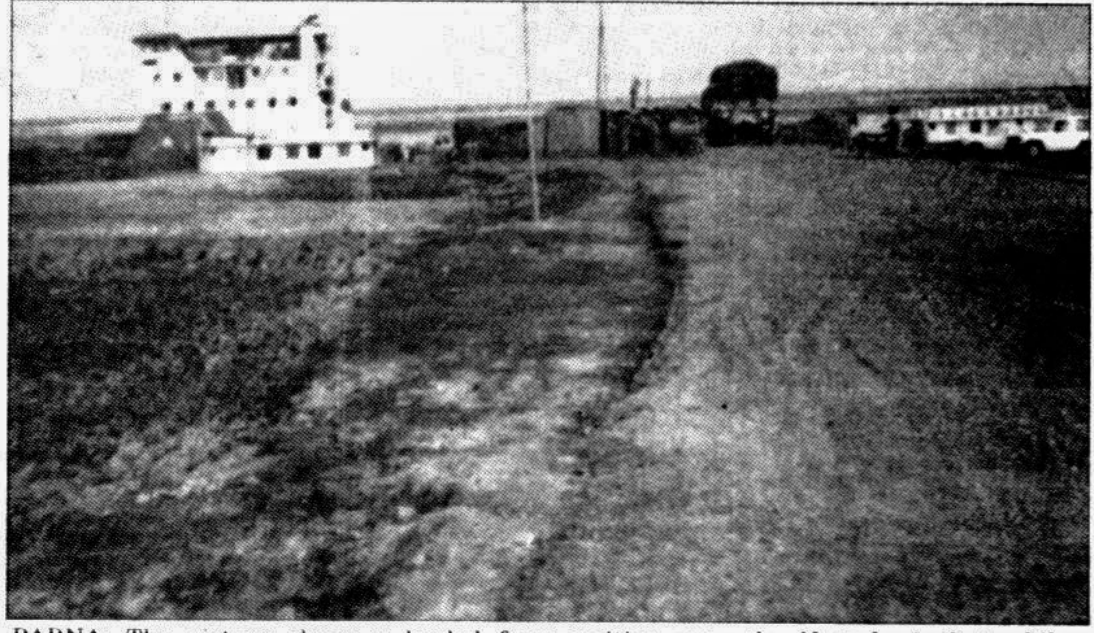
PABNA: The picture shows a loaded ferry waiting near the Nagarbari ghat while dredging operation wherever necessary on its way to Aricha is being carried out before its departure last Tuesday afternoon. Ferries have to face such fate of delayed journey almost in all routes resulting in creation of traffic jam at the ghats.

whole night (Friday) from 10 pm to 6 am when a ferry got stranded closing the narrow river channel near the Nagarbari ferry ghat. Several ferries were seen anchored at different points in the river with hundred of buses and other vehicles. A number of ferries did not leave Aricha bound for Nagarbari due to this situation. The passengers of the buses and ferries faced enormous sufferings during the period as witnessed by this correspondent. According to the sources, the stranded vessel, Shahparan was rescued at about 6 am Saturday and plying of the ferries resumed following this. Nagarbari ghat sources said that some miscreants were pulling away the erected marking flags from the river channel every now and then in the night for last one week making plying of the ferries even more difficult and risky. Long queue of vehicles were seen at both ends of the ferry ghats. Most of the vehicles were passenger night coaches. A case was filed with the police.