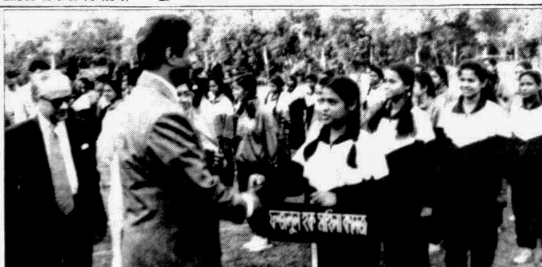
Home Minister Rafiqul Islam, BU, shakes with the participants of the Delta Life inter-college ball women handball competition during the opening ceremony at the Dhanmordi Women's Sports Complex yesterday.

Thirteen teams are participating in the meet, organised by Bangladesh Handball Federation.