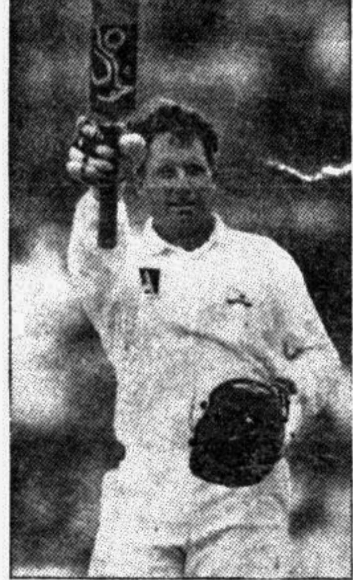
HEALY ... 161 n.o

The sixth-wicket pair weathered the second new ball