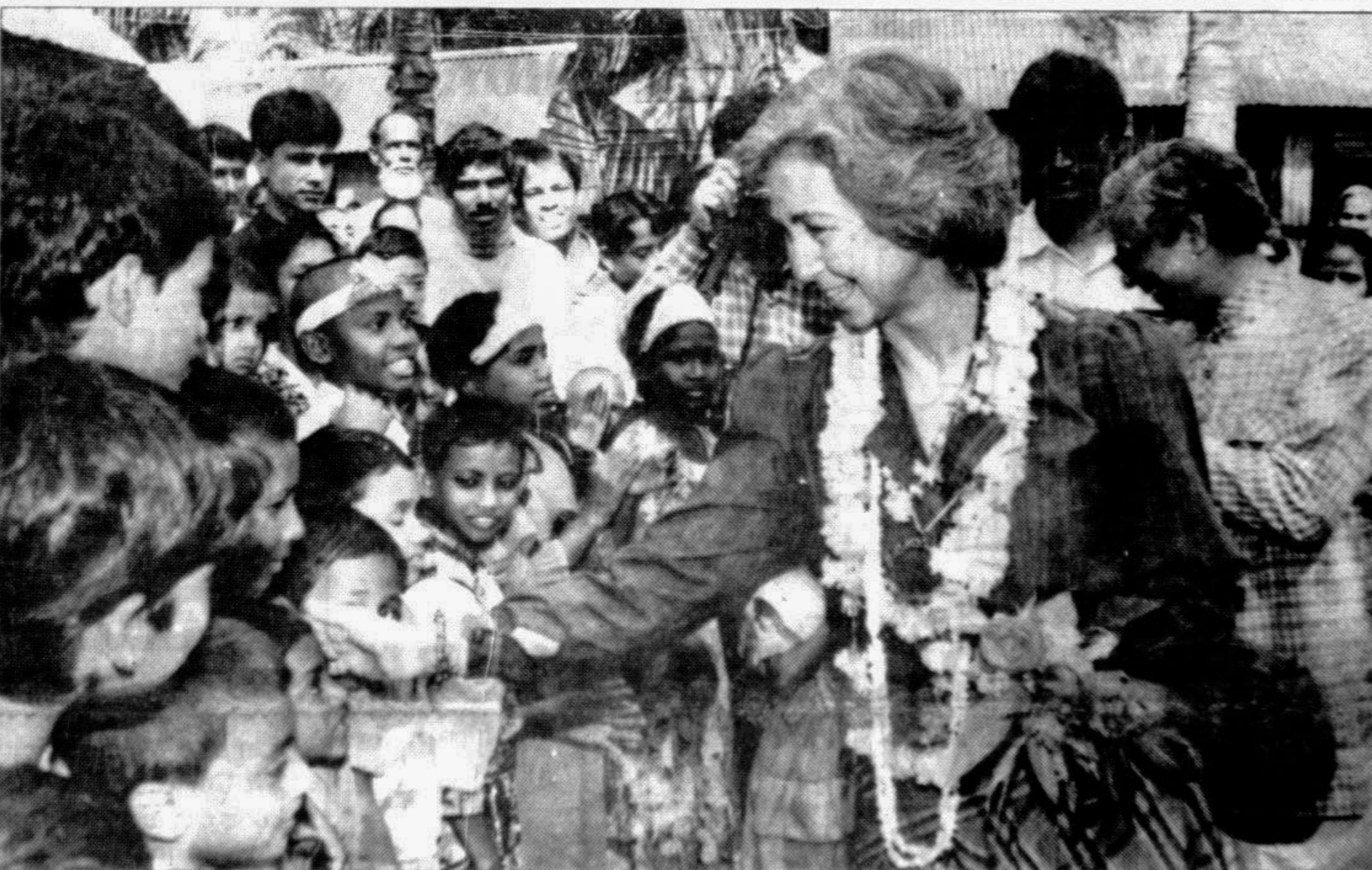
Spanish Queen Sophia during her visit to a Grameen Bank project at Mograpara in Sonargaon yesterday.

BCL supporters brought out a protest procession and ransacked the Medinova Clinic on SS road, owned by a BNP supporter. They also damaged and looted a stationary shop of a Jubo Dal leader at Borobazar.