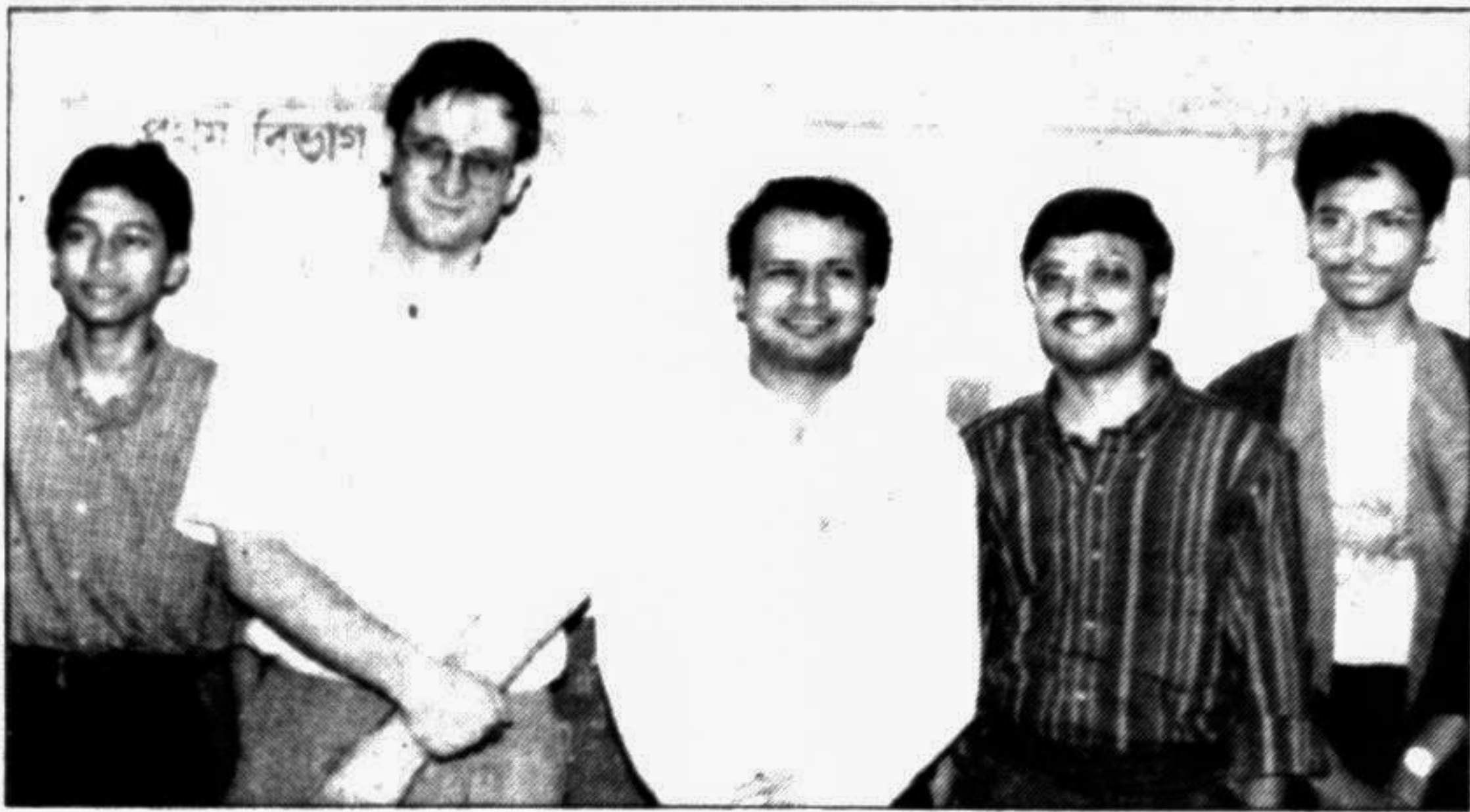
Mohammedan Sporting Club chess team.

Fahim Farhan Mridul Amjad Memorial High School (Remember to bring one passport size photograph and your ID card while collecting winner's prize from the Sports Desk of The Daily Star on Nov 27 at 8 pm.)