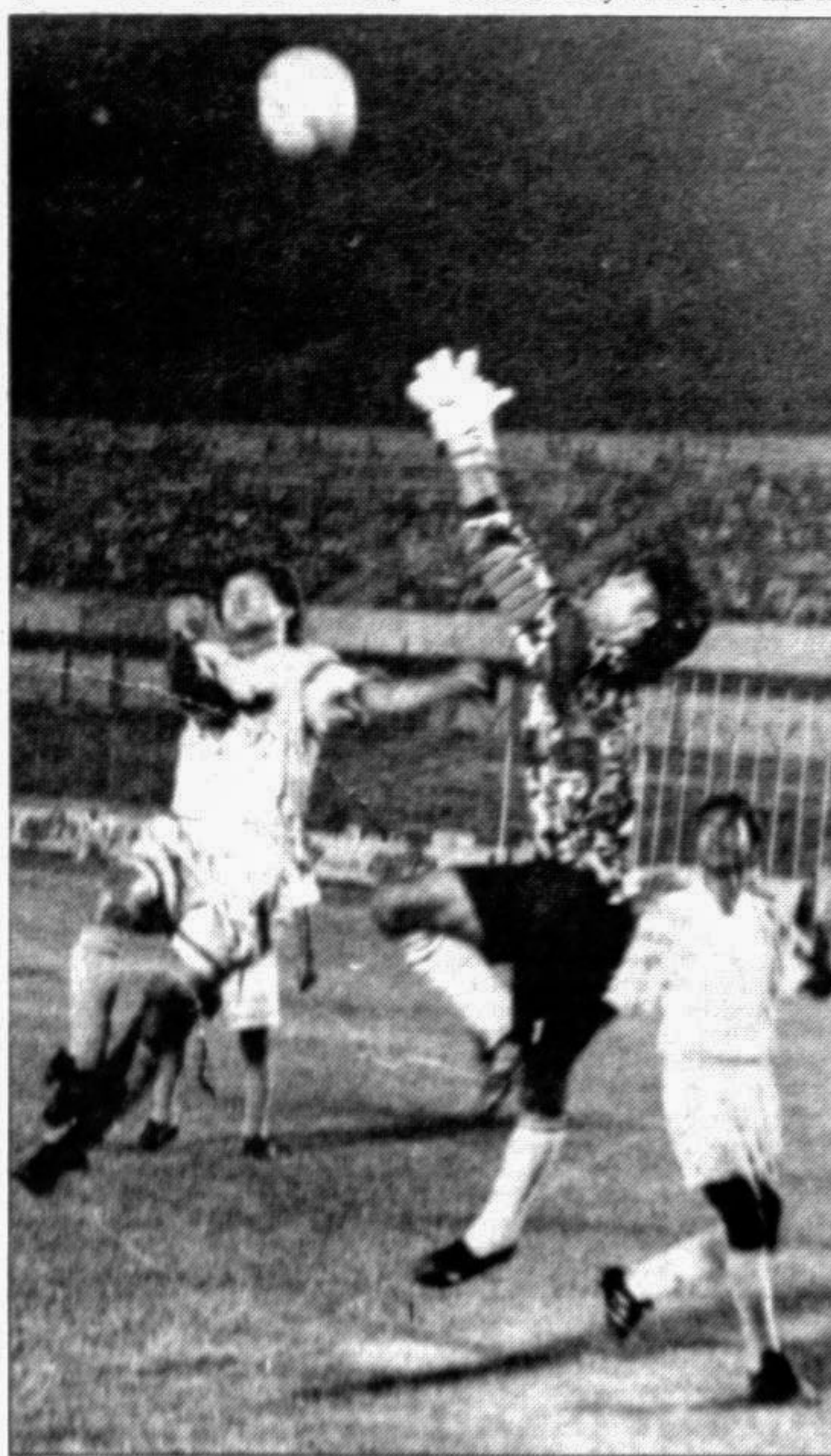
A goal mouth action from yesterday's Danish Premier Division football league encounter between Abahani and Farashganj Sporting Club at the Mirpur Stadium. Abahani won 3-2.