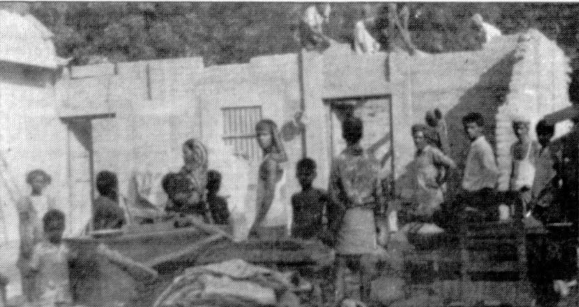
CHAPAINWABGANJ: Erosion of the river Padma has taken such a serious turn recently at Pucca Union under Shibganj thana in the district that houseowners setting for safer places by dismantling their homesteads.