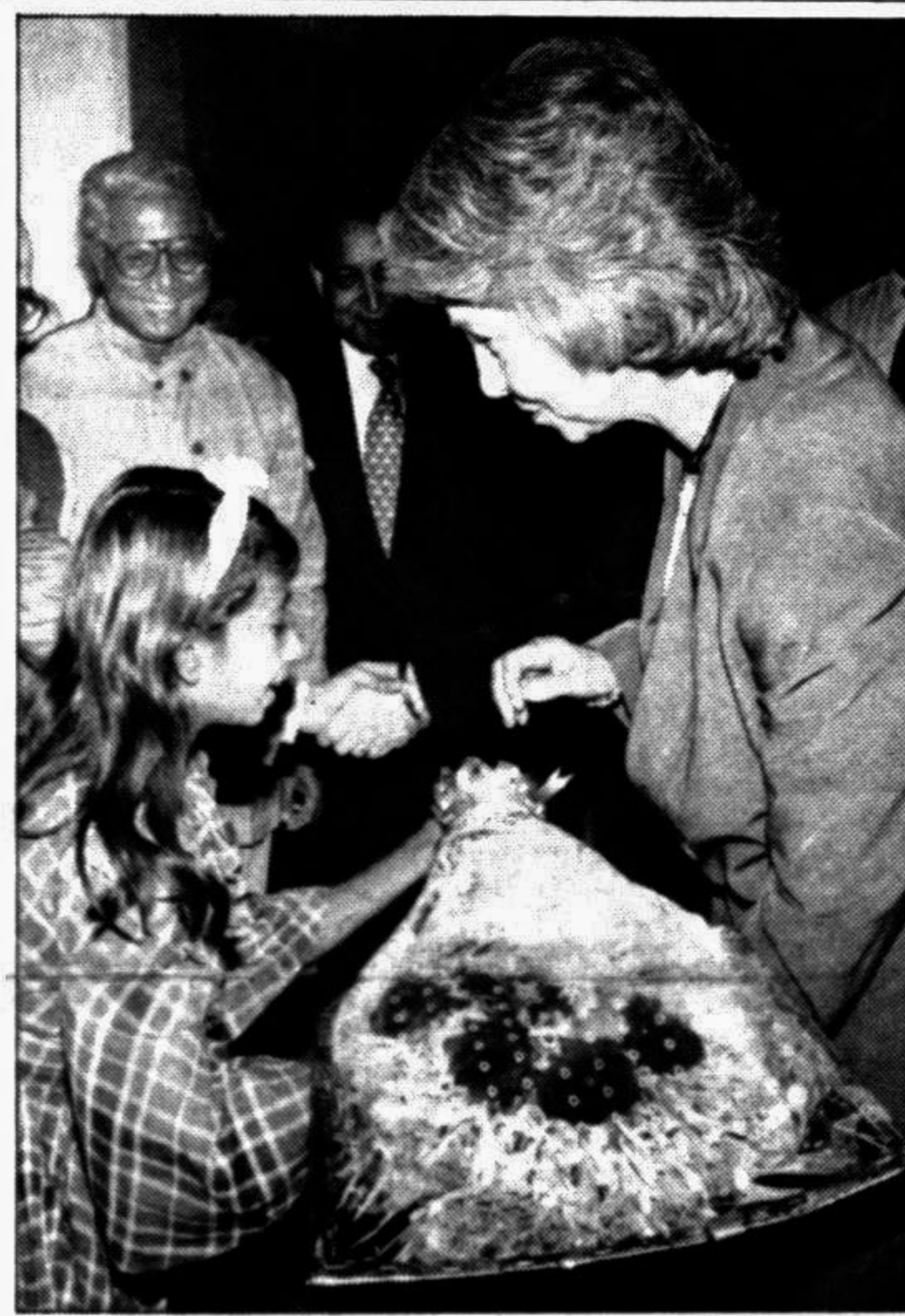
Queen Sophia being presented a bouquet upon her arrival at the Zia International Airport yesterday.