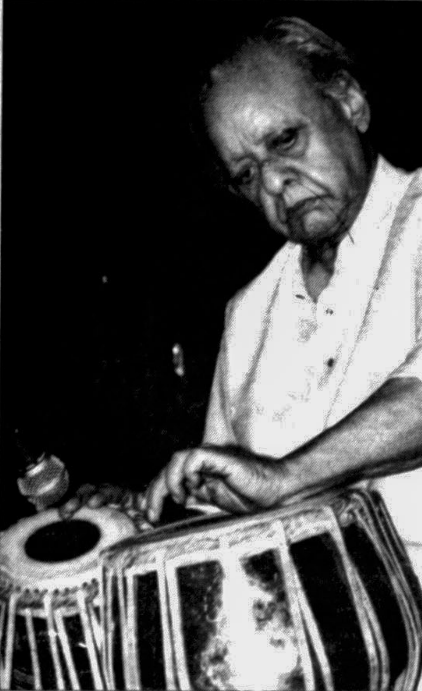
Eminent 'tabalchi' Alla Rakha Khan performing at the India Festival at Shilpakala Academy auditorium in the city yesterday.

The rescued minors were identified as Dipu, 4, and Munni, 3, of Gulshan in Dhaka.