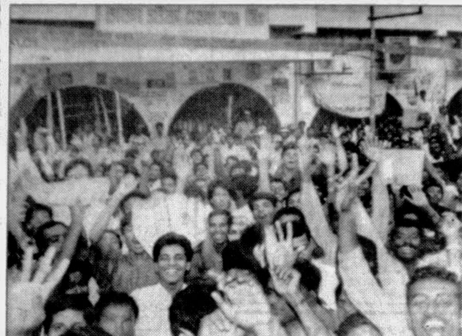
Kerb market share traders lay siege to the DSE building protesting fall in share prices (L), police in front of the building (C) and the desolate stock market area after police lobbed tear gas shells (R).

Police said, the AL leader of Dakop thana had kidnapped a fish trader, Rezaul, from the city on Nov 12. He was rescued by police while being taken in a trawler to an unknown destination. But Abul Hossain managed to escape.