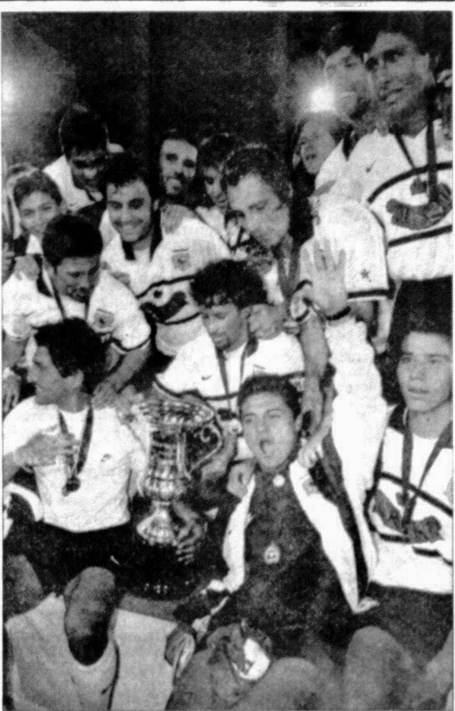
Players of Chilean football club Colo Colo celebrate after clinching the national title following a 1-1 draw against Auxad Italiano in their final match in Santiago on Nov 17.

Costa Rica and finished last in the three team group. Mexico were the lone CONCACAF qualifiers for the 1966 World Cup. Canada also have qualified for the six-team CONCACAF finals. The teams will play a league schedule next spring and fall to send three teams to France.