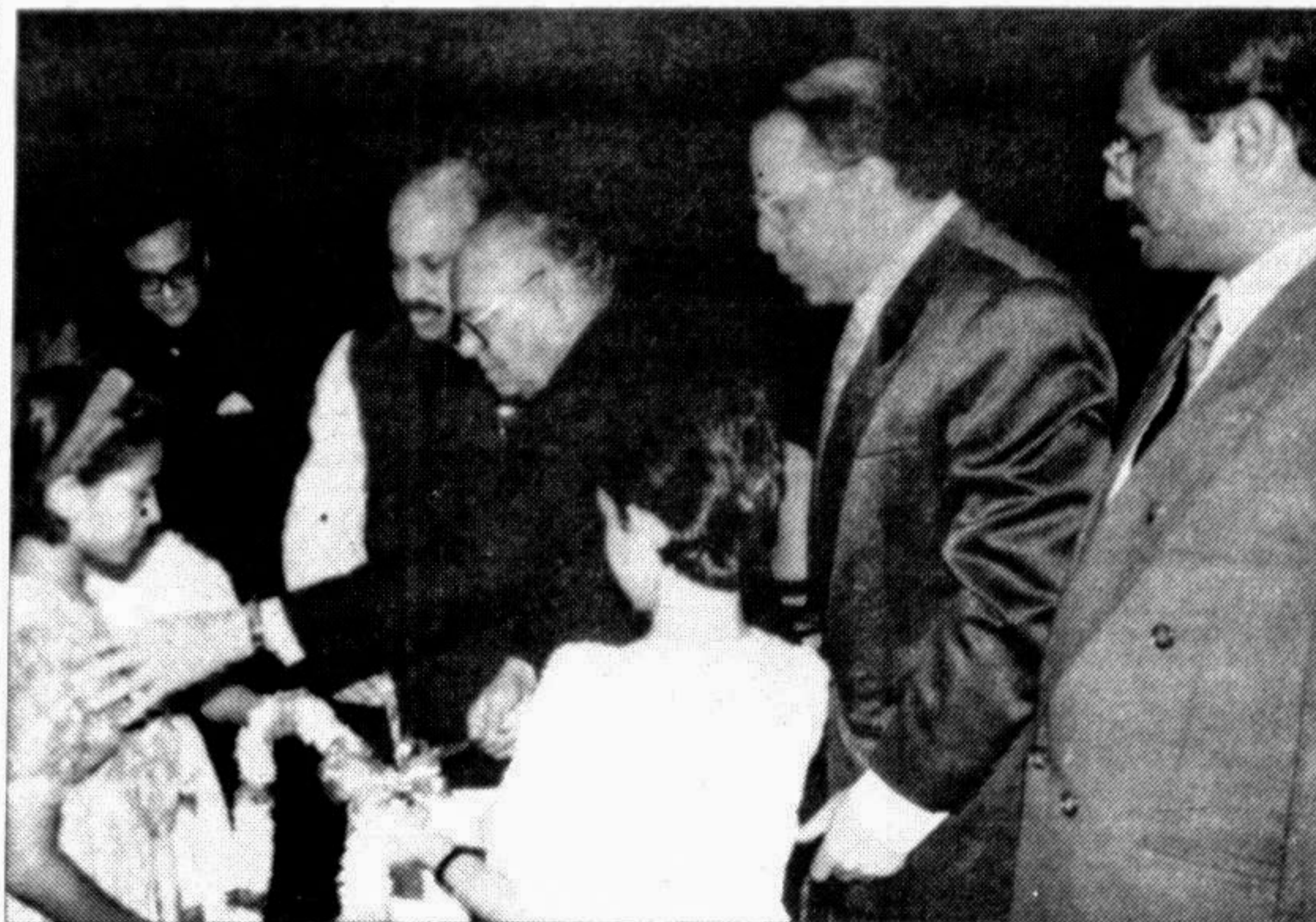
The 13-day India Festival was jointly inaugurated by the visiting Indian Human Resources Minister SR Bommai and Post and Telecommunications Minister Mohammad Nasim at the Osmani Memorial Auditorium yesterday.