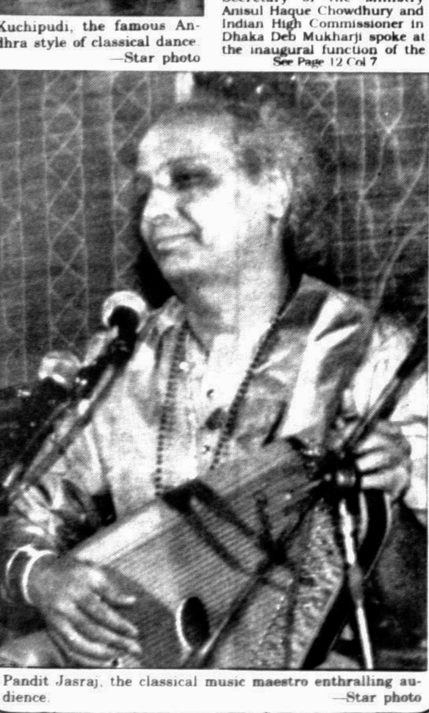
Pandit Jasraj, the classical music maestro enrapturing audience.