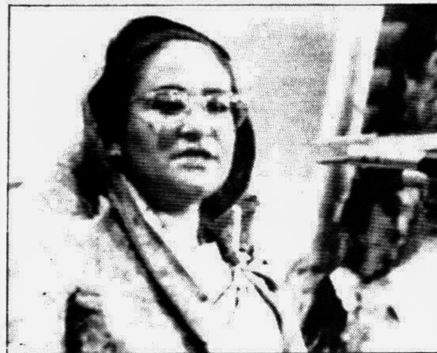
Prime Minister Sheikh Hasina addressing the World Food Summit at the FAO headquarters in Rome yesterday.