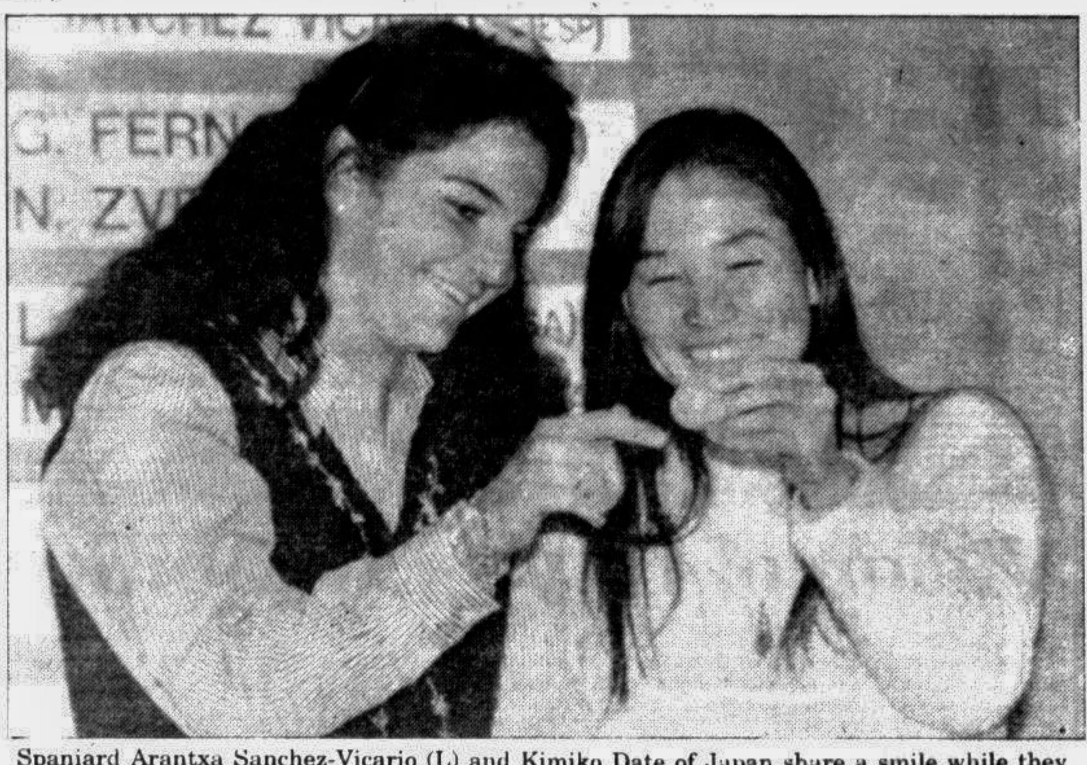
Spaniard Arantxa Sanchez-Vicario (L) and Kimiko Date of Japan share a smile while they look at a number from the draw for the Women's Tennis Association Championships on Nov 14.

HOBART, Nov 15: Openers Matthew Hayden and Matthew Elliott batted throughout the day Friday to take Australian XI to 316 for no wicket on the first day of the four-day match against the West Indies at Bellerive Oval, reports AP.