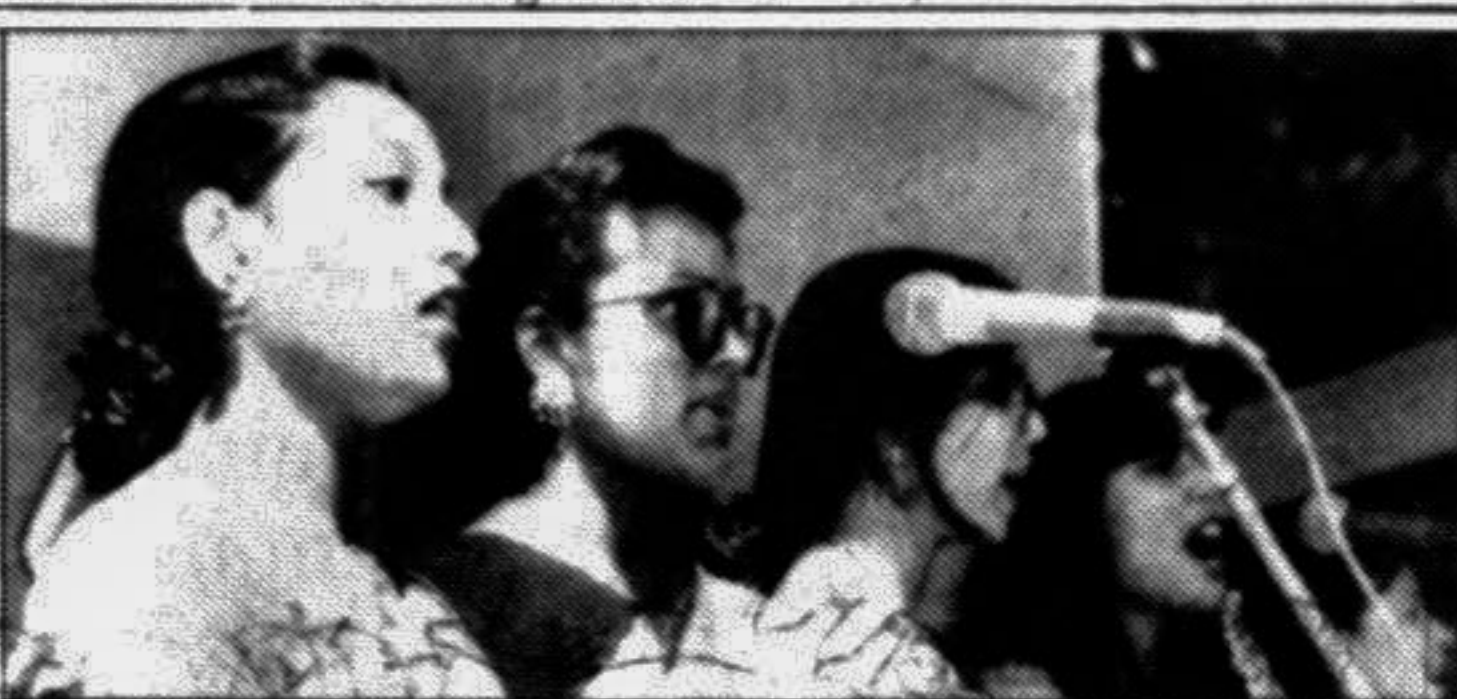
Artists rendering songs at a cultural function, organised by the Rudra Sangsad at TSC, DU yesterday.

Rahman said the present government of Prime Minister Sheikh Hasina has accorded top priority to rural development and expansion of employment opportunities in villages to raise the health status of commonman. The inaugural session of the workshop was followed by two business sessions in which researchers and experts from home and abroad participated.