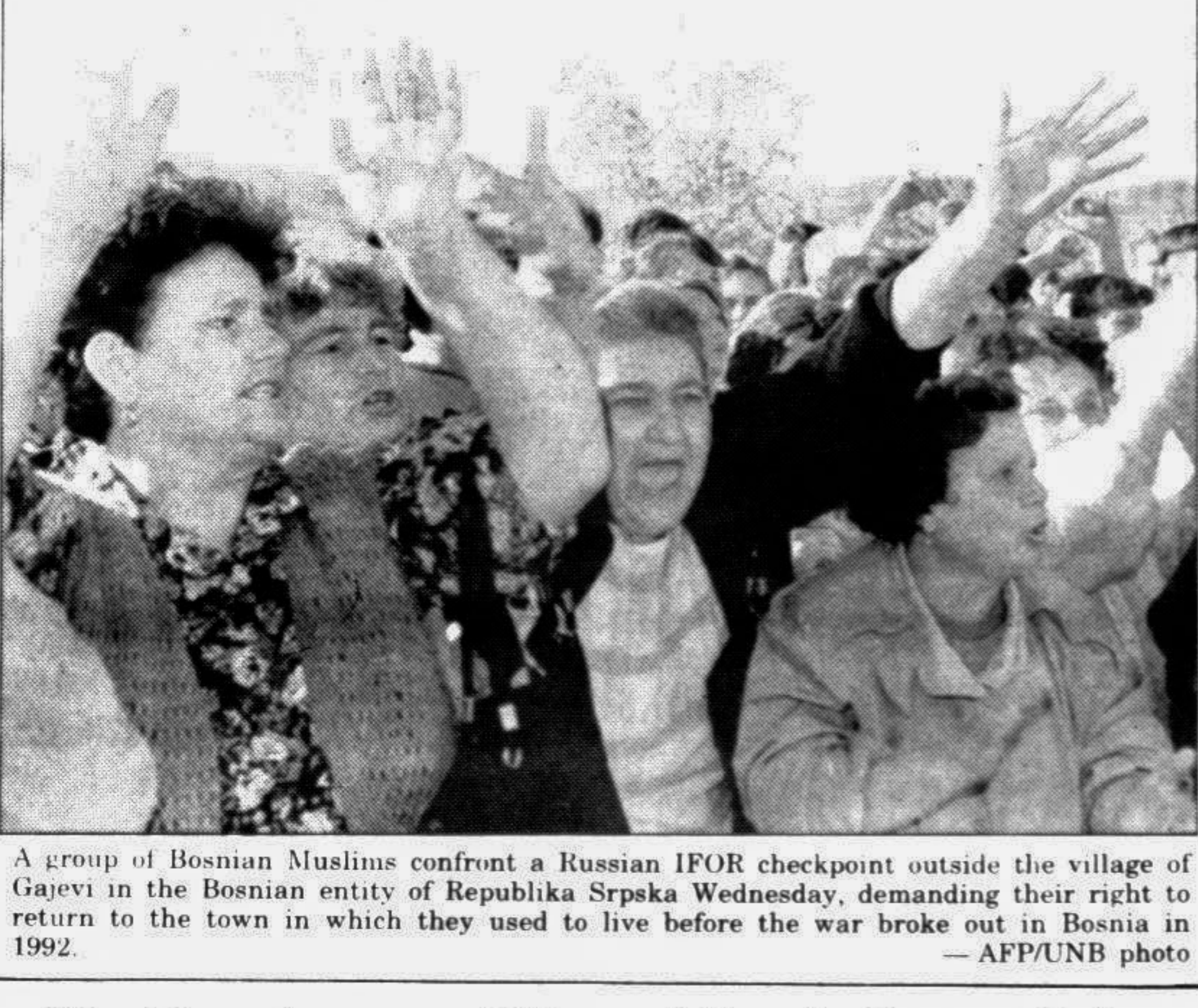
A group of Bosnian Muslims confront a Russian IFOR checkpoint outside the village of Gajevi in the Bosnian entity of Republika Srpska Wednesday...