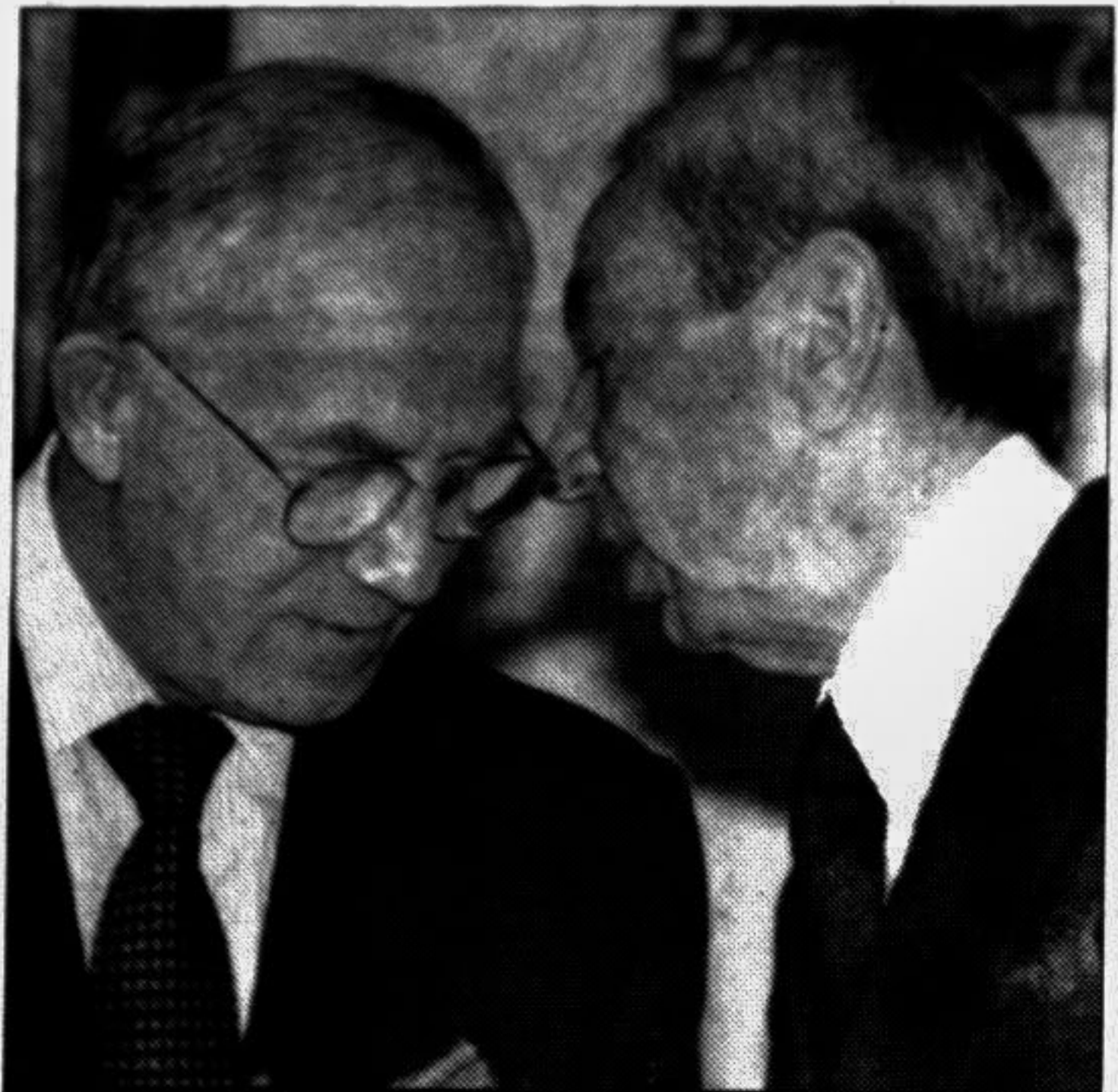
US Secretary of State Warren Christopher whispers to French Foreign Minister Herve de Charette Wednesday at the Foreign Ministry in Paris...