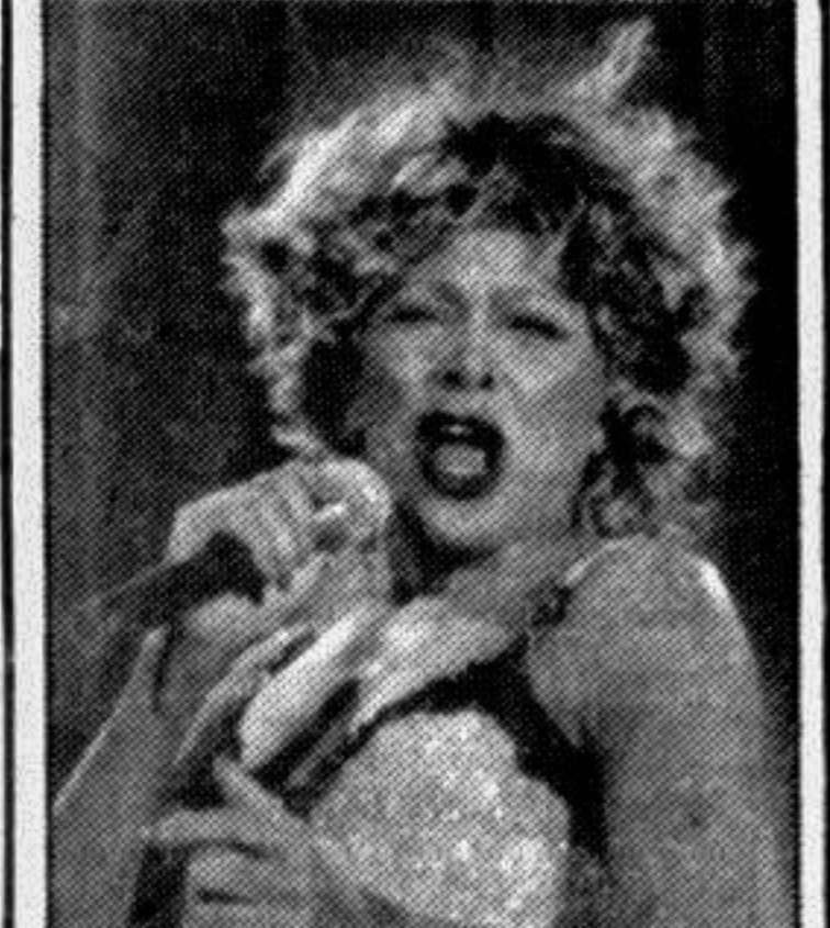
US rock star Tina Turner performs on Wednesday during the first of her three concerts in Frankfurt, as part of her 'Wildest Dreams World Tour 96.'